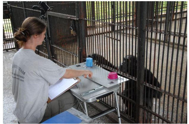
Figure 1. General setup with covered safe option (blue/tall cup) and risky option (pink/shallow cup). The centres of the two plastic lids on which the options were presented were 42 cm apart.

Chimpanzees were tested individually in their familiar sleeping rooms. The experimenter (E) presented two choice options hidden under two different cups on a table in front of the testing room (figure 1). The 'safe' option always held three pieces of apple; the 'risky' option either held six pieces of apple or none with a 50%