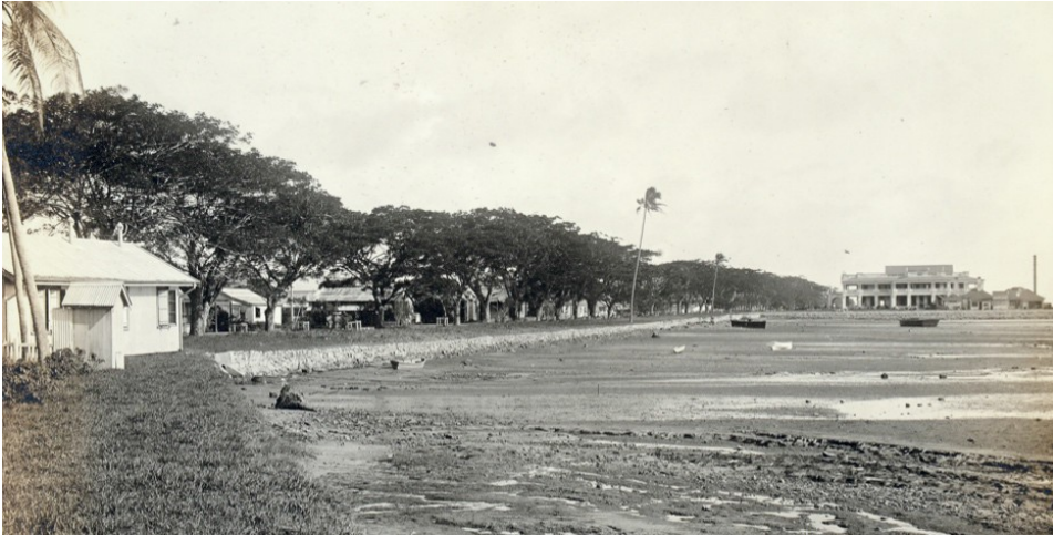
Figure 2: Reclamation works at Victoria Parade, Suva, 1915.