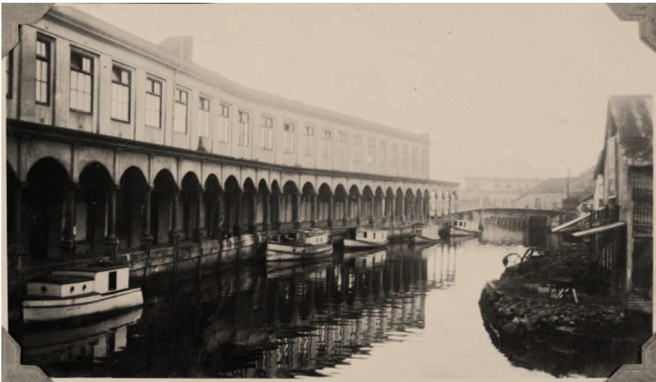
Figure 4 --- The colonnade on Nabukalou Creek (1928).