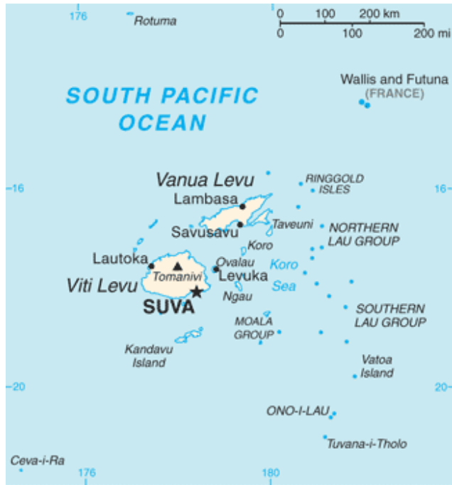
Figure 1 - Map of Fiji showing Suva and Levuka.