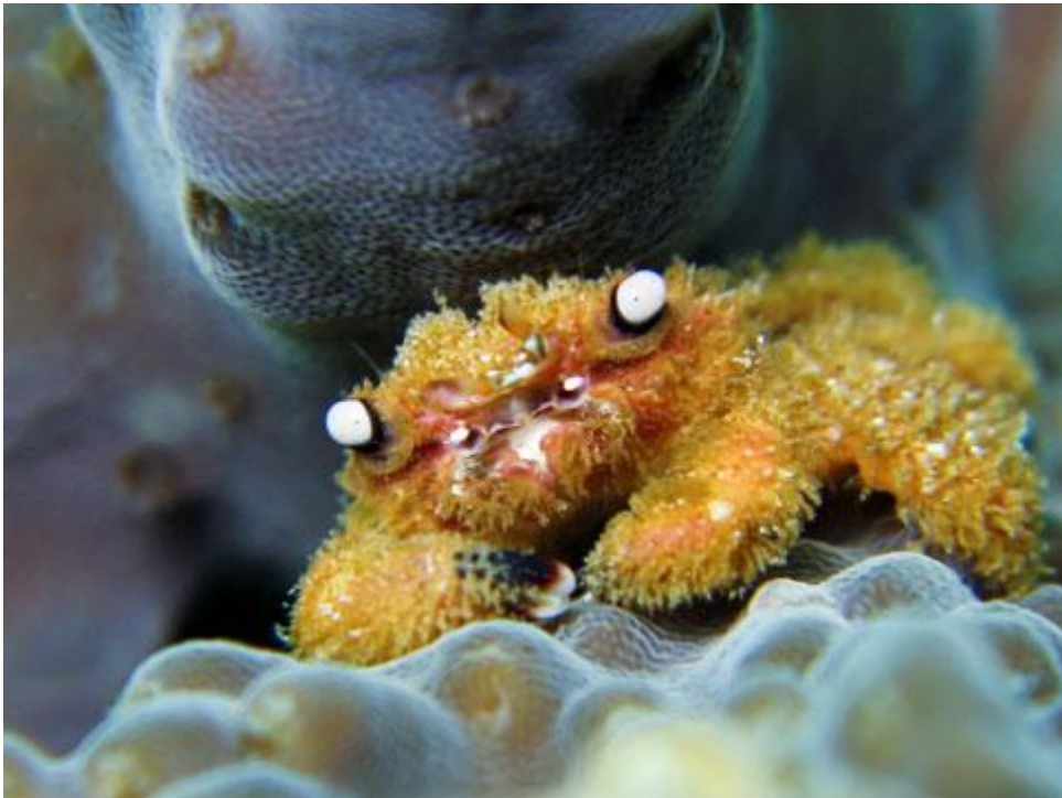
Fig. 1 Cymo melanodactylus on Acropora

B. Mayes 6 Warwick House, Sutton Coldfields, West Midlands, UK