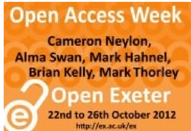
Figure 1: Publicity for Open Exeter Event