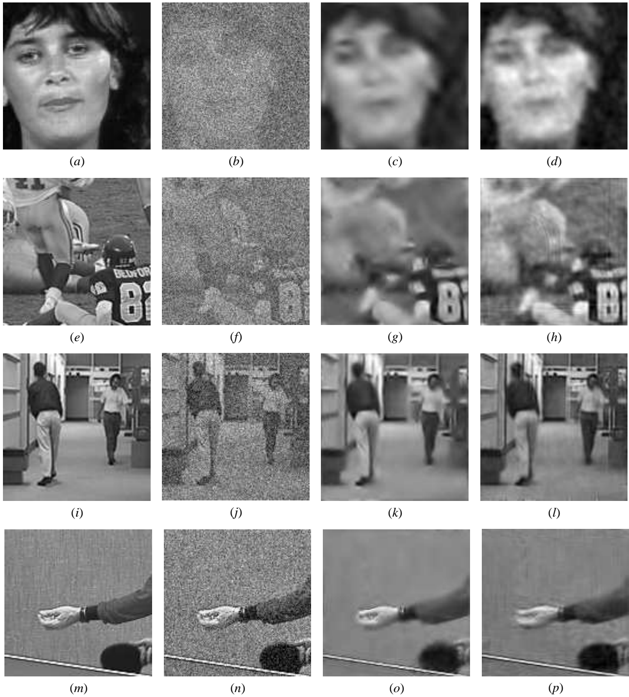
Fig. 2. Denoising results for four standard video sequences

(a) Frame# 90 of Miss America (b) Noisy (SNR=0dB) (c) TIW (SNR=17.9dB) (d) TI-Planelets (SNR=18.1dB)