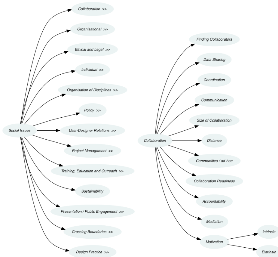
Figure 3: Excerpt from the Coding Scheme

The system allows searches using a number of criteria such as: disciplinary affiliation of respondent ('what problems do social scientists face?') or the usage of specific services ('what problems do people face who are using service X?'). Alternatively, the typology can be used to browse the findings. The system uses a diagram representation of the typology as shown in Figure 3 . Nodes are clickable and their selection either reveals a list of related barriers or expands the typology to a finer level. For example, in the diagram presented in Figure 3 , clicking on 'Collaboration >>' produces the diagram shown on the right hand side.