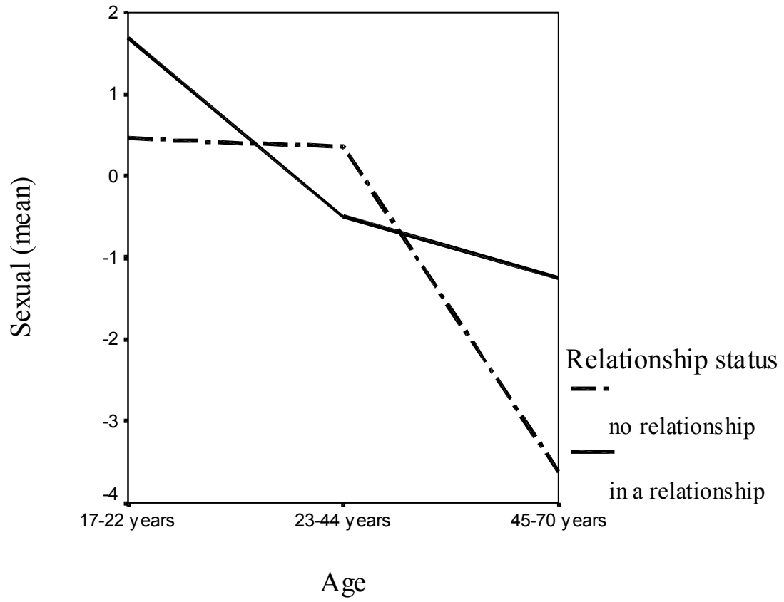
FIG. 2. Interaction for age by relationship status on sexual