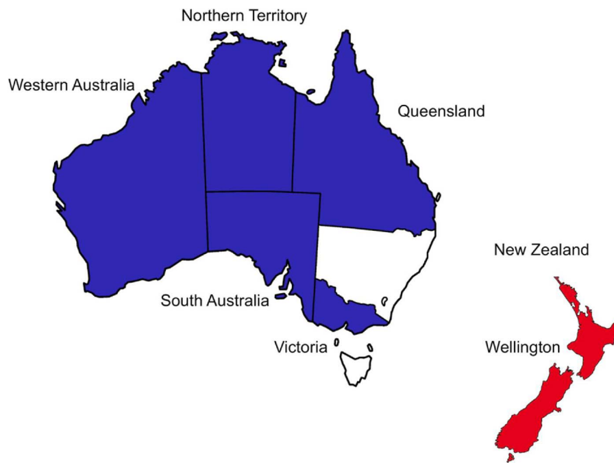
Fig. 1. Map of ambulance services contributing to the Aus-ROC Australian and New Zealand OHCA Epistry in 2015.