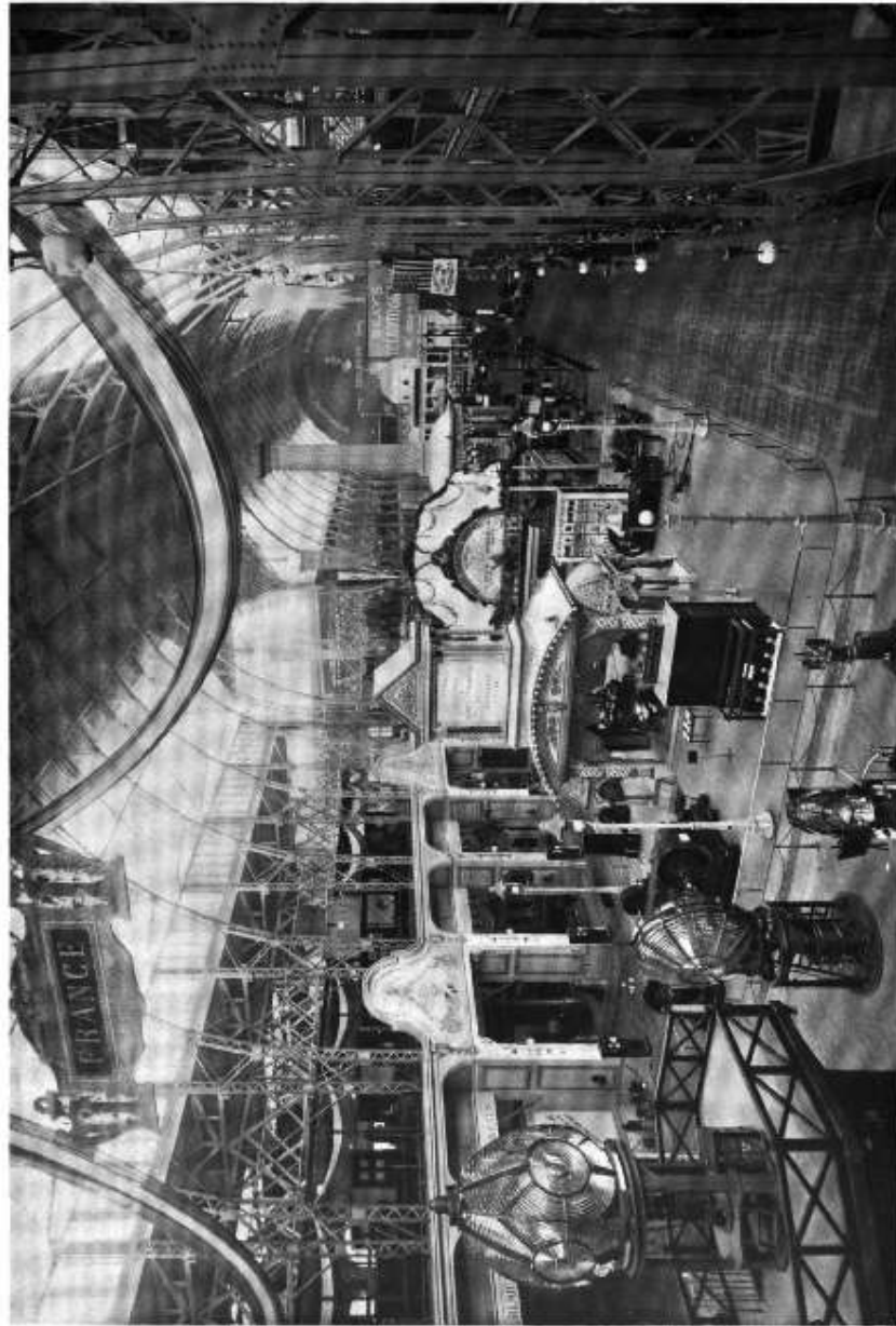
AN INTERIOR VIEW OF THE ELECTRICITY BUILDING.