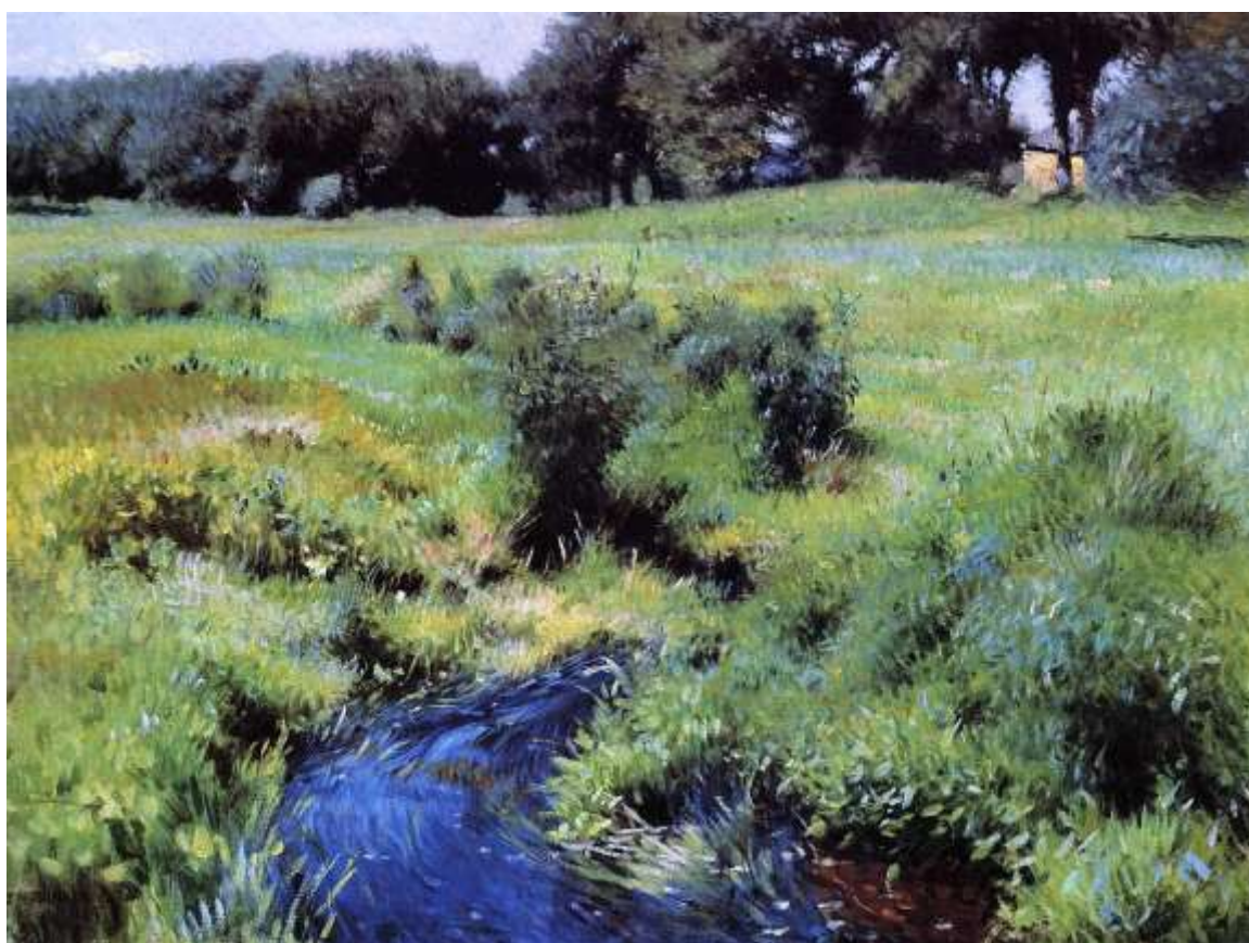
Figure 3. Dennis Miller Bunker, “The Pool, Medfield,” 1889