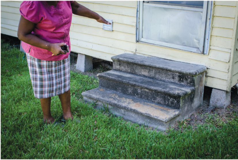
Figure 2. A research participant demonstrates how cracks have appeared around the doorframes of her house and the foundations have slowly subsided since industry moved in. These slow observations contribute to informal understandings of pollution.

In other words, it is up to scientists and writers to represent the seemingly incomprehensible; to translate what is slow and complex into something that is catchy, simple, and fast. Yet such a translation can be viewed as an invasive narrative (Lidström et al., 2015); a reworking of pollution that becomes distant from the people who are actually impacted by toxic geographies. Such a rendering would ignore the slow observations made by people in Freetown, and can ‘prevent more nuanced, disparate and varied means of conceiving of environmental change’ (Lidström et al., 2015: 28). Indeed, what this representation overlooks are the possibilities of putting the perspectives of people who co-exist with pollution at the centre of accounts of slow violence.