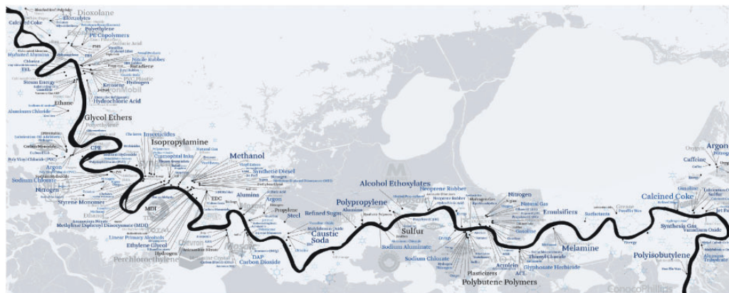
Figure 1. Titled ‘Petrochemical Landscape’, this map showcases the chemical geographies of Cancer Alley, along the lower stretch of the Mississippi River in Louisiana (Misrach and Orff, 2014).

(Watts, 2015a: 236) helps to break down – or fractionate – a cocktail of hydrocarbon molecules, from which high octane gasoline, benzene, ethylene, diesel, butadiene, methanol, bitumen, asphalt, polycarbons, jet fuel, sulphur, and solid coke are produced, among many other reactive, mundane, useful, and toxic substances. With Louisiana hosting almost one-fifth of total US oil reserves; one-tenth of natural-gas reserves; 2 and employing an estimated 16.2% of its labour force directly in the oil and gas sector (API, 2014), this petrochemical assemblage undoubtedly supports ‘a vibrant and distinctive working-class oil culture’ (Watts, 2015b: 172). Yet for some communities and environmental activists who live alongside ‘the guts of the industry’ (Appel, 2015: 18), the region between these two river-cities is regularly referred to as Cancer Alley. Indeed, a perception of increased health risks associated with the visible presence of petrochemical infrastructure is widespread in the region (Allen, 2003; Ottinger, 2013; Pezzullo, 2007).