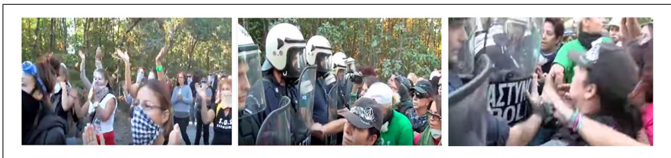
Sequence 5. Women's bodies on the line in the clashes with the police.

https://www.youtube.com/watch?v=ccVrjDoFnVE .