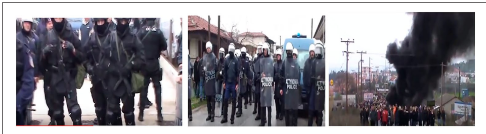
Sequence 2. Riot police at Lerissos village.

https://www.youtube.com/watch?v=4RlBWbVt4Bg .