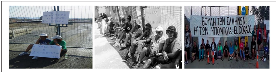
Sequence 3. Women chain themselves to the entrance of the mining site.

https://www.youtube.com/watch?v=gT_y54Q8BeA&t=12s .