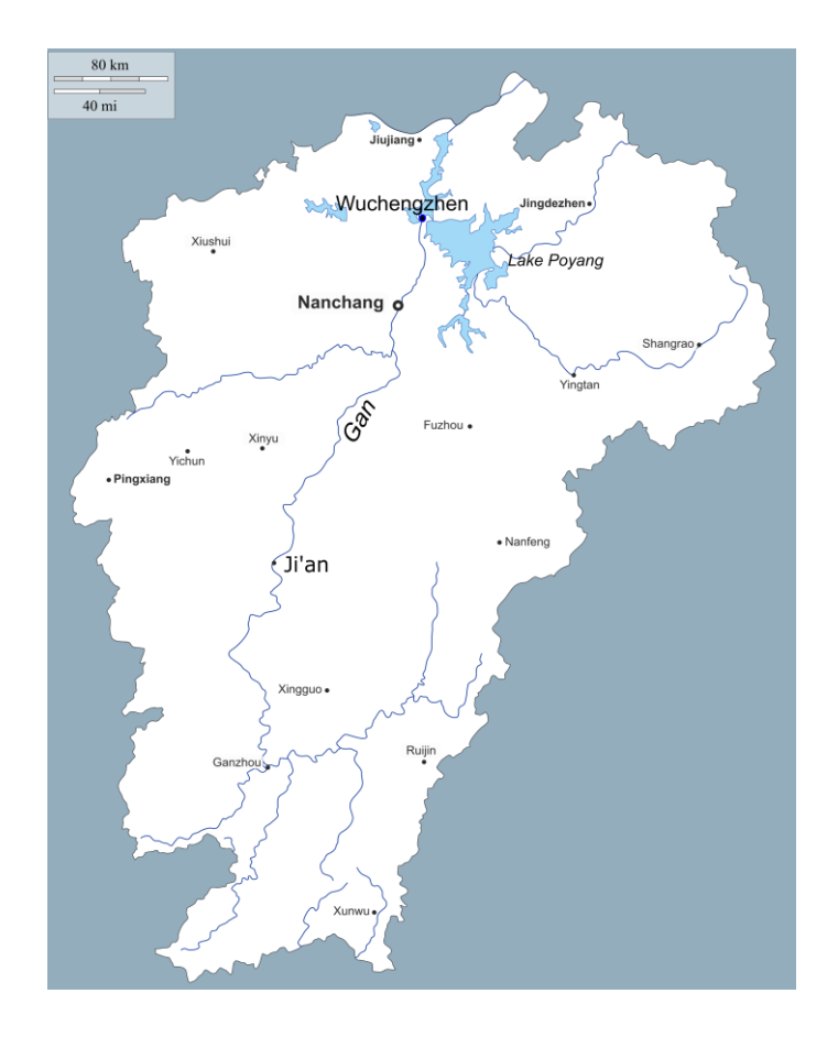
Figure 2. Map of Jiangxi province.

To the north of the spit, the lake narrows as it leads towards the Yangzi; to the south of the spit, the lake widens significantly. Because of the fluctuations in the size of the lake, the lake's shores are irregular and the land surrounding the lake marshy. The ecological characteristics of the region have made it a place favoured by migratory birds; 98% of the world's population of Siberian cranes overwinter at Lake Poyang, as do egrets, spoonbills, storks, swans, geese, ducks, and shorebirds. The area has the status of a nature reserve (the Poyang Lake Nature Reserve) and is counted amongst the now 27 Wetlands of International Importance (the so-called 'Ramsar List') in China. The counties immediately surrounding the lake were prone to flooding and the land was not considered to be particularly fertile. The editors of a late seventeenth-century gazetteer for this region described what the region's yielded in terms of natural products as follows: 'The best products everywhere in