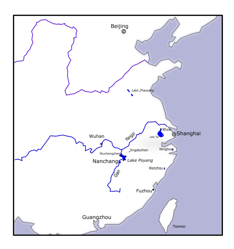
Figure 1. Outline map of southern China.

By piecing together the various representations of Wuchengzhen's history, we can see the town in various perspectives, ranging from the local to the global, via the (trans)regional and the (trans)national. More importantly, I intend to use the discussion of this single town to demonstrate the importance of the tools of cultural history for challenging the ways in which such terms are often deployed. Far too often, the scales of analysis – local, regional, global, etc. – are applied by historians with hindsight and from the outside; the terms are assumed to have an a priori significance, as if 'the local' or 'the global' always refer to the same units of analysis.<sup>2</sup> Instead, I seek to identify the ways in which spatial frameworks are generated within the specific sources that feature this town, to see what the place meant to those who created those sources. In this way, I hope this discussion of an early modern Chinese town can help not only to make cultural history more global but also to show the importance of cultural history for the study of global connections.