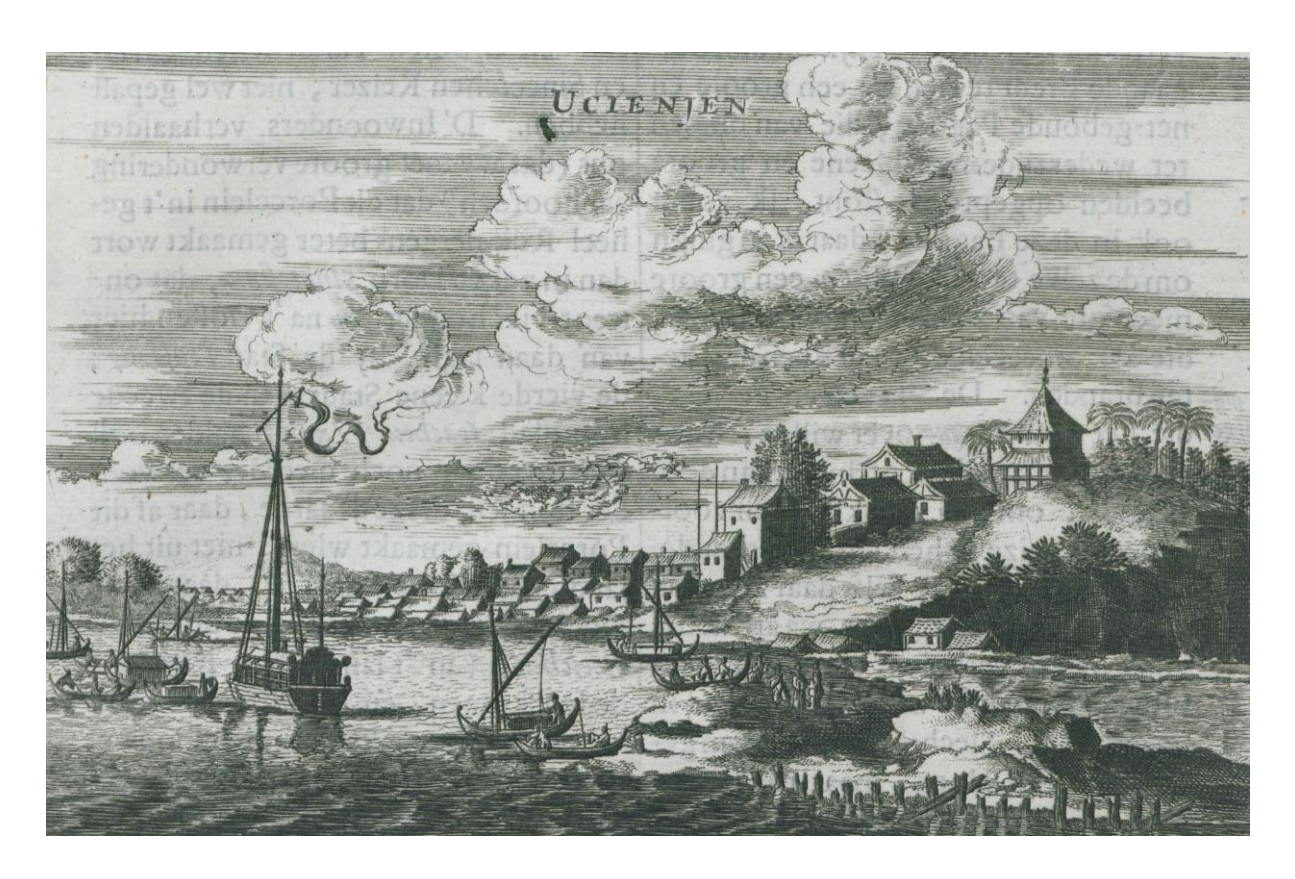
Figure 5. 'Ucienjen'. Engraving from Johan Nieuhof, Het gezantschap der Neêrlandtsche Oost-Indische Compagnie, aan den grooten Tartarischen Cham, den tegenwoordigen keizer van China (Amsterdam: Van Meurs, 1670), p. 89. Held in the Koninklijke Bibliotheek, Den Haag.

The image in Figure 5 is from the 1670 edition of Nieuhof's travel account, as published by the Amsterdam publisher Van Meurs. To the right of the image, we see a hill, populated with several grand buildings with decorated rooves, described in the text as elegant ('cierlijk'). Closer to the water, the illustration features smaller, anonymous-looking buildings that suggest the humbler dwellings of workers or traders. The foreground is entirely taken up by water and water-based activities. One large ship, seen from its stern, has a cabin with several windows and a banner flying from its single mast, perhaps suggesting the mode of transport the Dutch delegation was using. The other vessels are all smaller, though several seem large enough to transport cargo. Throughout the image, there is evidence of human activity, matching the Dutch description of the town as 'neringrijk', a