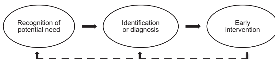
FIGURE 1 Pathway of access to early intervention

Various factors might influence the process of access to EI, and the way these factors operate may vary for the three different phases. Using our framework depicting the pathway of access to EI might be a useful starting point to identify factors that influence access to EI for families of children with developmental disabilities, to develop understanding of why some families are not accessing support.