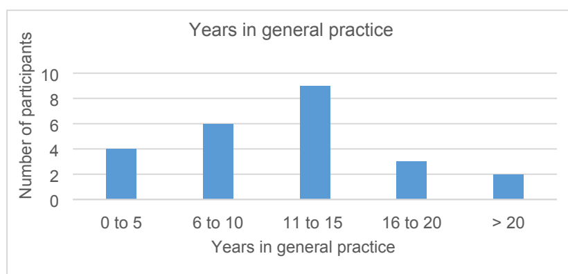
Figure 1. Years in general practice