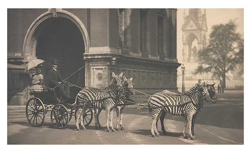
Figure 1. Lord Walter Rothschild's carriage drawn by zebras and a disguised horse, in front of the Royal Albert Hall (© The Trustees of the Natural History Museum, London. Licensed under the Open Government Licence).

From the Middle Ages to the 18th century, the notion of domestic animals did not necessarily imply human domination, but rather proximity to human habitation (Latin domus ). In scientific taxonomy, the word domesticus still echoes this old conception: Passer domesticus (House sparrow), Acheta domesticus (House cricket) or Mus musculus domesticus (House mouse) are called domestic though they are 'wild commensals' in present zoological terminology.