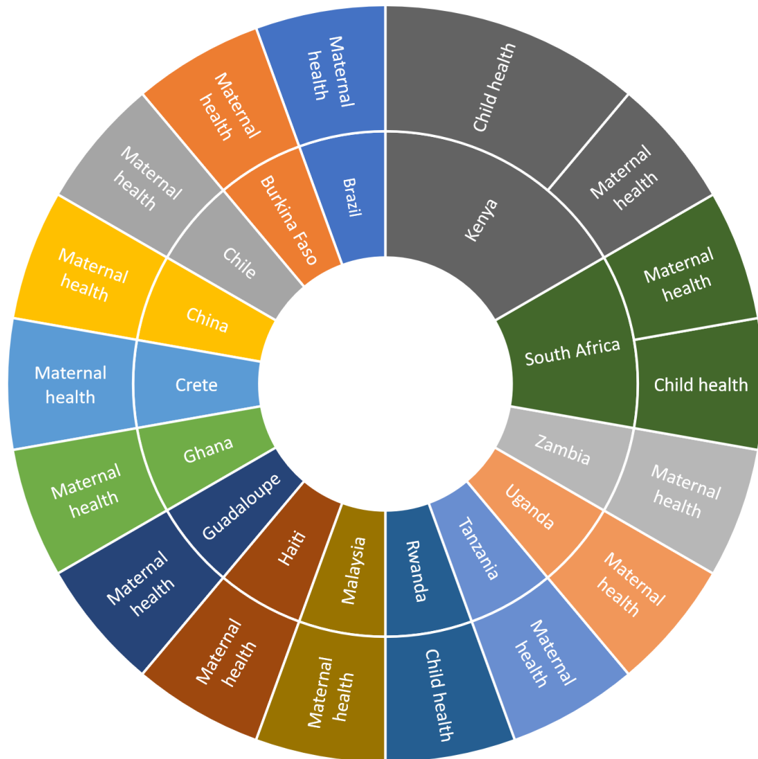
Figure 2 Geographical distribution of the 17 studies included in the scoping review.

resistance to condom use as a means of family planning. 41 Additionally, Den Hollander et al in Ghana underscored women's low negotiating ability and autonomy in healthcare decision making. 40 The study reported wide power differences between health providers and women, especially in a context shaped by authority. Women were generally uninformed about their basic health information. A high level of therapeutic misconceptions was also observed in this study. Women were also reported to rely more often on a medical professional's opinion rather than being guided by their motivation. 40