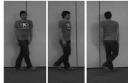
FIGURE 1 Still images of a training and two test videos from a single trial in the verb learning task. Note. The video clip in the training stage was played twice, then disappeared, and immediately the two video clips in the test stage were shown side-by-side in the two-alternative choice task. In this example, the target is shown on the left and the distractor on the right in the test stage