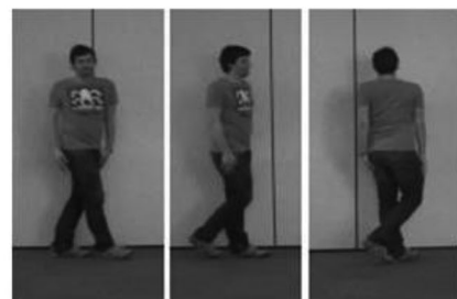
FIGURE 2 Still images of a training and two test videos from a single trial in the memory task. Note. The video clip in the training stage was played twice, then disappeared, and immediately the two video clips in the test stage were shown side-by-side in the two-alternative choice task. In this example, the target is shown on the left and the distractor on the right in the test stage