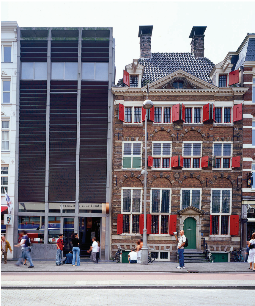
Fig. 7. Rembrandthuis Museum with new annex, c.2000.

Information Centre (Fig. 7). At the same time, a complete remodelling of the interior of the house was proposed. Some changes had occurred since 1911, when only a few paintings were displayed in the voorhuys and sydelcaemer . Thanks to the purchase or loan of paintings by Rembrandt's contemporaries and pupils and the antique furniture gradually introduced into the main rooms, the house had been subtly modified and domesticated. What happened in 1998–9 was far more radical. It involved dismantling de Bazel's work and creating an interior that suggested what the house might have looked like in Rembrandt's day. In