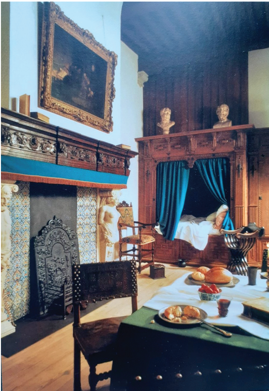
Fig. 9. Rembrandthuis Museum, the parlour ( sydelcaemer ), postcard, 2014.

and of a young woman standing next to the box-bed in the sydelcaemer . Prospective visitors were invited to ‘Get close to Rembrandt’ and ‘Get close to Saskia’. 45