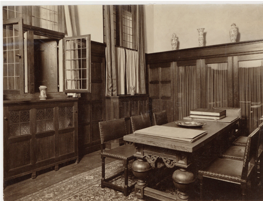
Fig. 3. Rembrandthuis Museum, the living room ( agtercaemer offie sael ; now the sael ), c.1912. Amsterdam City Archives, OSIM 00003000942.