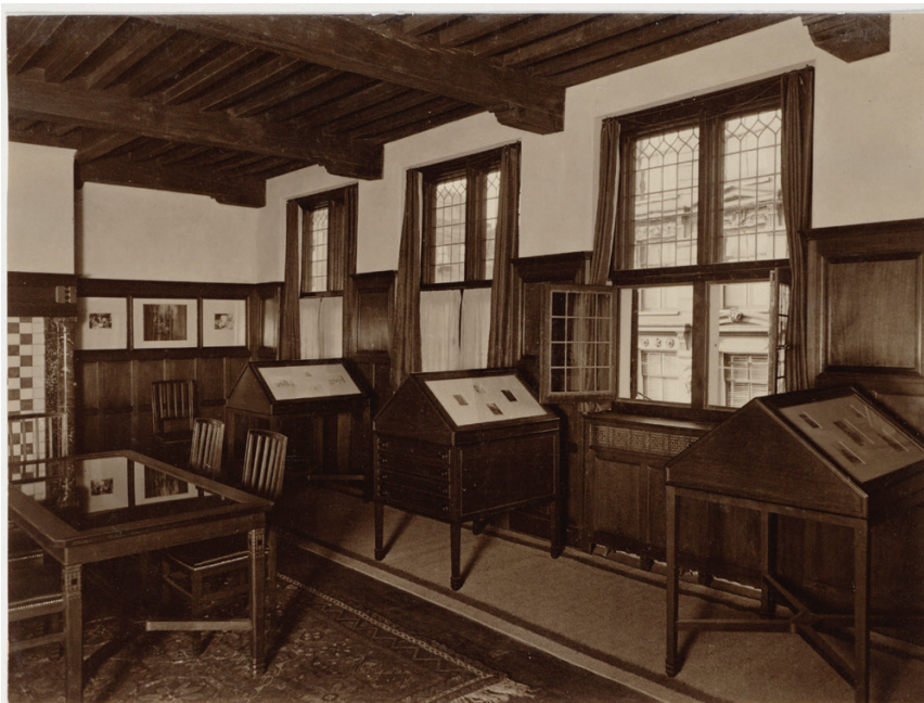
Fig. 4. Rembrandthuis Museum, the studio ( schildercaemer), c.1912.

Traditionally, light featured prominently in the discussion of Rembrandt and his legacy. The painting of the Night Watch was flanked by engaged columns topped with caryatids representing Morning and Afternoon. On the other side of the room, two more caryatids representing Day and Night (a homage to Michelangelo's Medici tombs) symbolized the