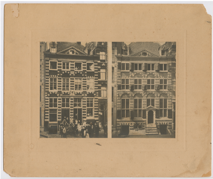
Fig. 2. Rembrandt's house before (c. 1910, left ) and after (c. 1920, right ) restoration.

is missing'. 15 Using the room-by-room inventory of the contents compiled in 1656, de Bazel decided to evoke rather than mimic a seventeenth-century domestic interior in order to create a modern museum. He designed a series of rooms that corresponded to those mentioned in the inventory: an entrance hall, side rooms, a back living room and a first-floor studio and cabinet room, where Rembrandt's own collection was once housed. Where certain features were in doubt (as in the small studio for Rembrandt's apprentices, or a partition in the main studio), they were omitted. New requirements were also met: in place of the spiral staircase giving access to the upper floors, a wide stair was created by borrowing the space originally occupied by a small office on the ground floor and an anteroom to the cabinet on the floor above. 16 The basement and the attic were used as offices for museum staff.