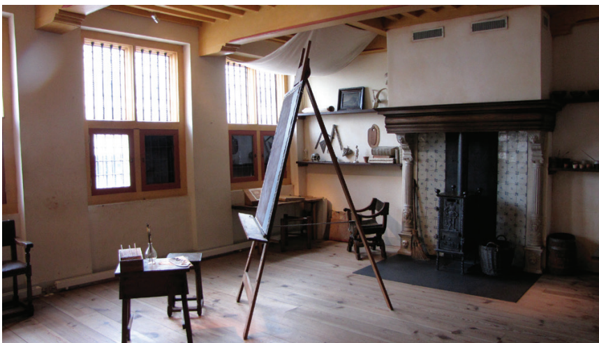
Fig. 8. Rembrandthuis Museum, the studio ( schildercaemer ) in its present state.

The closure of the Rijksmuseum for refurbishment between 2003 and 2013 seems to have encouraged the concept of the Rembrandthuis museum as a place where visitors could encounter the look and feel of a seventeenth-century house. This did not stop with furnishings. A series of photographic postcards on sale in the museum in 2014 show the rooms with traces of habitation – half-eaten meals, abandoned letters, stretched canvases, a pile of sewing – as though the occupants have just slipped out (Fig. 9). The lighting is rich and warm. The linkage between this place and the life of the artist who once inhabited it was underlined in two posters advertising the Rembrandthuis, commissioned in the same year from the photographer Maarten Schets. In these, the romantic trope of artist and model came into play, with photographs of a young man perched beside an easel,