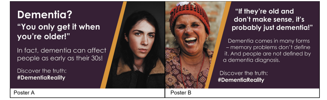
Figure 2. Our campaign posters advertised on Twitter.

These campaign posters were delivered to 239,360 UK Twitter users who saw at least one of them, and 2.12% (5071/239,360) of the users responded to our evaluation question. Furthermore, 8.05% (408/5071) of the users reported that the campaign had a positive impact, 5.70% (289/5071) reported a negative impact, 10.89% (552/5071) reported no impact, and most (3822/5071, 75.37%) users did not remember seeing it.