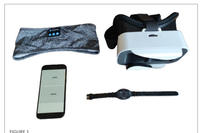
Equipment used; sleep headband with integrated wireless headphones, headset to hold phone for visual stimulation mode, smartphone with hBET app loaded, motionwatch 8 actigraph watch.

this frequency. A virtual reality headset is used to hold the phone in front of participants' eyes and exclude external light sources. Participants have their eyes closed during the stimulation. The screen brightness is pre-set at mid-range, but is under participants' control. The auditory programme utilises binaural beats to create 10 Hz stimulation since a 10 Hz tone is below the range of human hearing. A binaural beat is produced when different tones are presented to each ear, with the binaural beat frequency being the difference between the two tones (36). Tones at 400 Hz and 410 Hz are used in hBET as this range has been shown to produce the binaural beat effect most strongly (37). It is therefore necessary that headphones are used rather than an external speaker. For increased comfort in a lying position, participants are provided with a sleep headband with integrated headphones [model PT28, Perytong, Shenzhen, China]. The volume of auditory stimulation is under participants' control. The equipment participants used in the study is shown in Figure 1.