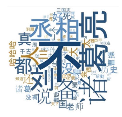
Figure 1. A cloud of frequently used words

constructed in a self-reflexive manner, as fellow Bilibili fans generated danmaku comments running across the screen when playing the sampled videos.