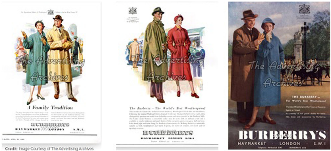
FIGURE 6 [Color figure can be viewed at wileyonlinelibrary.com ]