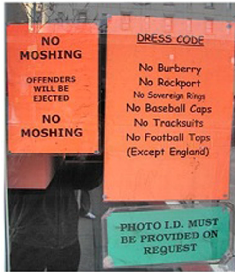
Snobs' club, Birmingham, 2004.

faced with the question of determining the image of a brand that is tarnished or unfairly taken advantage of. Indeed, it is hard to believe that in a context similar to the one presented above a new market entrant would like to be associated with a brand tarnished by a category of consumers with a bad reputation. What is however interesting is that this conflict between what Burberry wanted to communicate through its brand and what Burberry actually meant for UK consumers has led to a drop in demand for Burberry products, particularly in central London (Weston, 2016, p. 191). Thus, consumers' perception of the brand had a direct effect on the “economic behaviour of other consumers”. This example should therefore be a convincing argument in support of the idea that when a brand's reputation needs to be proven, it is not enough for the person claiming tarnishment or free-riding to prove only how it has positioned her brand. It is even more relevant to see how the brand was received and perceived by the public. On the other hand, this example seems to confirm the assertion that, mainly at that time, those who lost controlled over the communication channels suffered negative consequences.