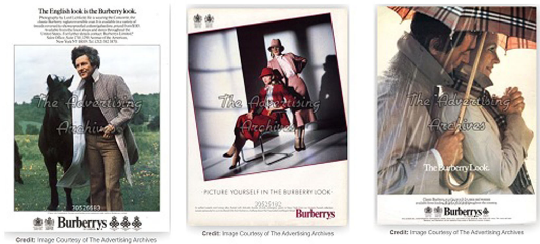
FIGURE 7 [Color figure can be viewed at wileyonlinelibrary.com ]

By the end of the 1990s, however, and during the 2000s, with Bravo's arrival as Burberry's CEO (Weston, 2016, p. 123), model Kate Moss started to dominate the company's ads campaigns, often photographed among groups of young and uninhibited people (Figure 9). In one ad, Kate Moss poses in a bathing suit made of the famous Burberry check, thus breaking the pattern of a conservative image. Bravo's marketing strategy considered, among other things, the combination of novelty elements with those aspects that made the Burberry brand a symbol of Britishness (i.e., "black taxi or red telephone box" (Pike, 2011, p. 123). The new image of the brand conveyed through the advertisements in fashion magazines, jointly with other measures of branding such as "brand association and placement among global celebrity" (Pike, 2011, p. 123) and marketing have been successful in creating a revitalized and aspirational image of the brand (Pike, 2011, p. 123).