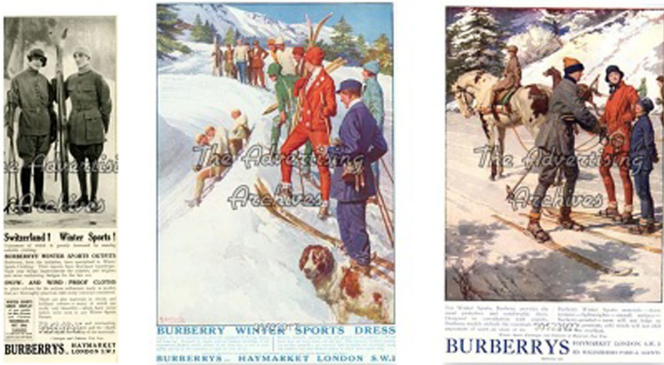
FIGURE 4 [Color figure can be viewed at wileyonlinelibrary.com ]