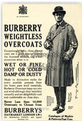
FIGURE 3 [Color figure can be viewed at wileyonlinelibrary.com ]

Beginning with the 1950s, several changes occurred in the way advertising practices are applied. Leiss, Kline and Jhally in their book on social communication in advertising (Leiss et al., 1997, p. 328) identified the "evolution of cultural frames for goods in relation to the development of media, marketing and advertising" (Leiss et al., 1997, p. 328) by analysing historical magazine advertising and advertising practices during 1890–1980. According to these authors, the 1950s were characterized by behaviourist marketing strategies and personalization in advertising strategies. Moreover, the topics covered in commercials during this decade include to "glamor, romance, sensuality, black magic, self-transformation" (Leiss et al., 1997, p. 329). Burberry's magazine ads during this period do not seem to reflect any of these themes that apparently were popular in the 1950. On the contrary, on most of its ads feature traditional couples and sometimes even the motto "A Family Tradition" as depicted in Figure 6.