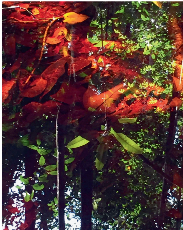
FIGURE 1 Reflections of the forest canopy in the waters of a peat-swamp in Indonesia.

Our reflections are also 'muddy': there are aspects of our experiences that we do not yet discuss, we still may not have processed. It feels like a difficult thing to do, like wading through mud, or trying to see in muddy waters, discussing 'positives' that have come from a pandemic that has taken over 6 million lives (World Health Organisation, 2022). We keep this and all its tensions in our minds, thinking too of the ongoing injustices occurring worldwide when it comes to equal access to vaccines and healthcare. Our reflections here are in many ways incomplete. Also, in our approach to writing collectively, what important details and nuances do we obscure? We nod here to the work of Kiriakos and Tienari (2018) and their reflections on what academic writing can be (see 'Academic writing as love'), as well as Helin (2019) who suggests that writing is a process of 'offering the tentative' to others, and one that is emergent, relational, and unfinished.