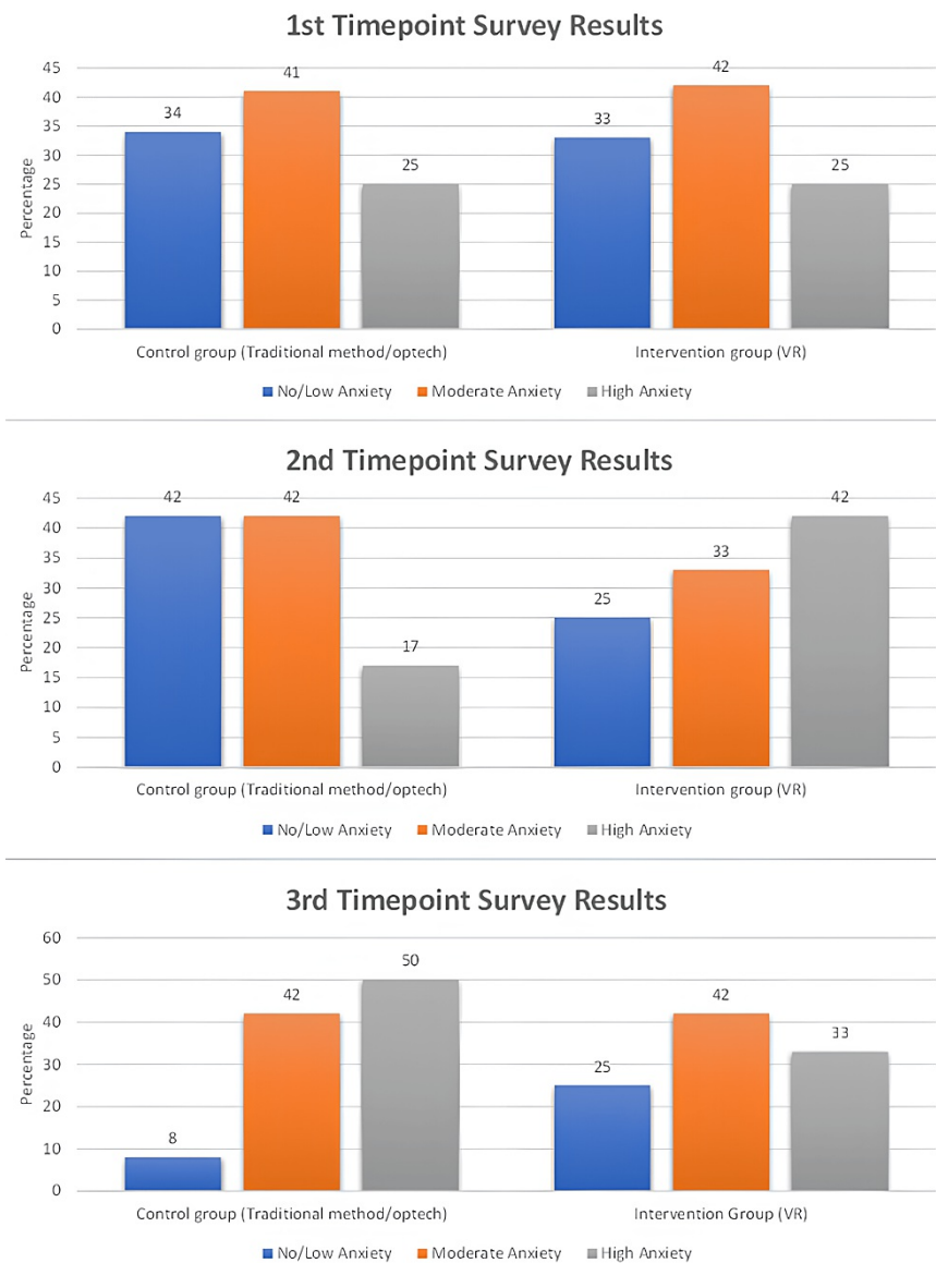
FIGURE 3: Depiction of STAI-6 result distributions between control and intervention groups over three time points.