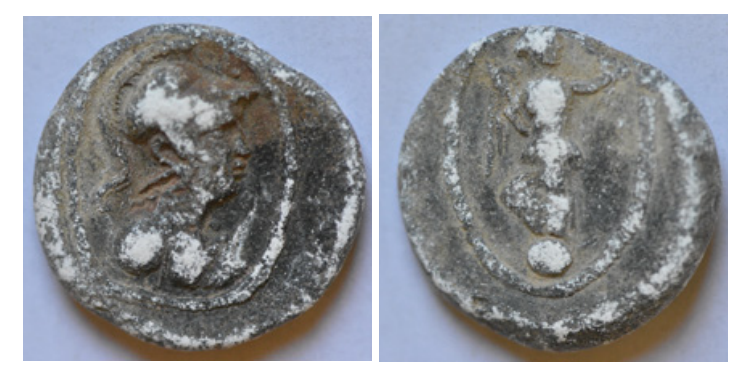
Figure 3.11 Pb token of Oxyrhynchus, 23 mm, 11 h, 13.70 g. Bust of Athena right wearing Corinthian helmet; linear border / Nike standing right on globe holding wreath in extended left hand and palm branch in right; linear border. cf. Milne 5291 for a token of the same type, found at Oxyrhynchus.

preserved in the Museo Archeologico Nazionale di Palestrina there are five tokens from Egypt (Figure 3.11).87 Since the collection was seized as the proceeds of illegal excavation activity, we cannot know the precise findspots of these items, but it is very likely these pieces were found in Italy. Indeed, the existence of migrants and merchants in Portus and Ostia is well established: the Isiac association of Portus, for example, seems to have been founded and dominated by individuals from Alexandria in Egypt.<sup>88</sup> Tokens rarely travelled between settlements, although there are several cases where tokens travelled (in small number) from one port to another, a reflection of the much broader exchange of people and goods that took place in these towns.<sup>89</sup> Stannard's analysis of a series of quadrangular bronze tokens found at both Ostia and Minturnae has also demonstrated that tokens moved between ports within Italy; Stannard suggested these particular pieces were connected to the workings of the ports and connected river systems.90