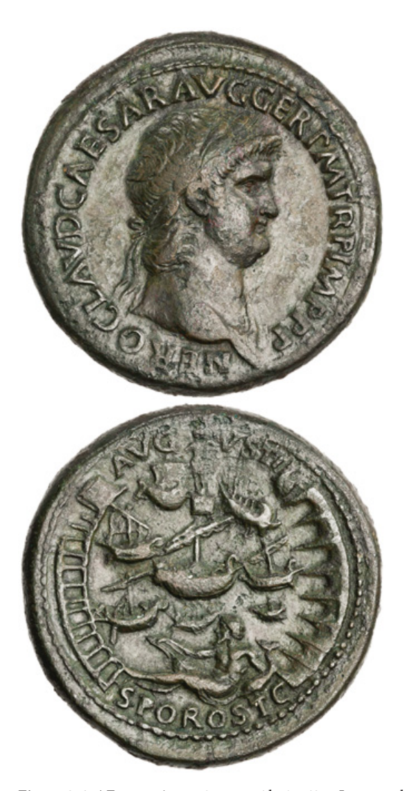
Figure 3.6 AE sestertius, c. 35 mm, 6 h, 27.69 g. Laureate head of Nero right, with aegis on neck, NERO CLAVD CAESAR AVG GER P M TR P IMP P P around / View of the harbour at Ostia, AVGVSTI above, POR OST beneath flanked by S C. RIC I<sup>2</sup> Nero 178.

harbour at Ostia.<sup>51</sup> Indeed, the representation of a similar figure on coinage of Pompeiopolis (Cilicia), reclining on a dolphin and holding a rudder as part of a harbour scene seems to confirm the identification. The relative rarity of the image and the fact that it appears in reference to these two