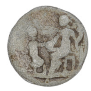
Figure 4.21 Pb token, 21.5 mm, 6.29 g, 12 h. Victory, standing right, crowning a nude male figure (boxer?) with a wreath, who stands right before her / Female figure seated left with cornucopia in left arm, clasping hands with a smaller figure standing before her. TURS 550, BMCRLT 770.

Another possible boxer (a nude male with a clenched fist) appears on TURS 917, with an erect phallus shown on the other side. <sup>167</sup> Further victorious athletes may be shown on TURS 566–7, which show a nude male figure carrying a wreath and palm branch. TURS 579 is described as showing two figures in tunics wrestling, with a bestiarius on the other side. A palombino mould half, designed to produce six circular tokens showing two pankratiasts facing each other with raised fists, with an amphora between them and leaves blossoming around them, was found during the 1908 excavations of the 'Syrian Sanctuary' on the Janiculum hill in Rome. <sup>168</sup> Unfortunately no image of the find was provided and its current whereabouts are unknown. No known token matches this description.