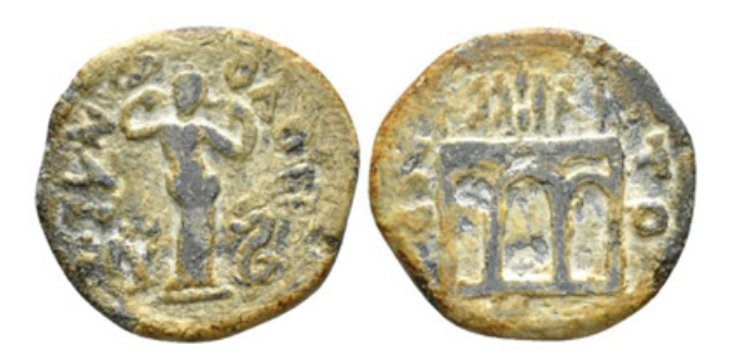
Figure 2.20 Pb token from Egypt, 20.5 mm, 5.10 g. Venus standing raising her hands to her hair, snake on right and cupid (?) on left / Triumphal arch surmounted by frontal quadriga . Dattari-Savio Pl. 323, 11706 (this token).

erected in the capital.<sup>153</sup> Whether the image of arches on Alexandrian coinage represented actual structures or was a 'stock type' is debated, but representations included the image of a triple span arch surmounted by a quadriga , as found on the token. A coin may have thus inspired the design of Figure 2.20, although the imagery has been paired with Venus instead of the imperial portrait. It is unlikely the Egyptian token was used within the context of a triumphal ceremony; the semantic flexibility of the arch is again revealed. Although at first sight the imagery on the token seems quite Roman, the presence of the snake on the right of Venus recalls the famous agathos daimon of Alexandria. The embodiment of good luck and health, the agathos daimon here probably communicates the same sentiment that feliciter or felix does on tokens from Rome and Ostia.