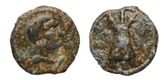
Figure 4.24 Pb token, 18 mm, 6 h, 4.53 g. Male head right / Modius with three corn-ears. TURS 372, Rostovtzeff and Prou, 1900: no. 79.

the other (Figure 5.15), and a lead issue is decorated with a modius on one side and a dolium on the other. Other issues carry imagery of various amphorae or dolia or have more creative representations – one issue, for example, carries a modius on one side accompanied by the legend FR and a nut or olive tree flanked by corn-ears on the other. A lead token, now in Berlin, displays a bunch of grapes on one side with a measurement, CONGIVS, written on the other – presumably a reference to a specific amount of wine. To reiterate, these tokens need not have been used as invitations for banquets in the same way as the Palmyrene tesserae ; the imagery may simply have been used to evoke leisure and abundance – the presence of several tokens carrying dolia or amphorae in the baths of the Cisiarii in Ostia demonstrate this (discussed in Chapter 3). Modii were also a popular design for Roman coinage, which may have inspired their adoption on other monetiform objects.