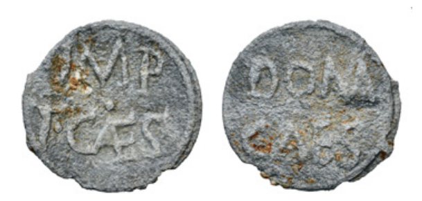
Figure 2.15 Pb token, 19 mm, 12 h, 1.77 g. IMP | T·CAES (AE ligate) / DOM | CAES. TURS 44.

Other themes, for example the very public connection between Domitian and Minerva communicated by coinage, appear to be absent. Tokens bearing representations of Minerva may indeed have been used during the reign of Domitian, but the image of the goddess was not directly placed alongside the emperor, meaning we have no way of deducing the date of tokens carrying the goddess' image. The ideology used during particular occasions, during festivals and their associated feasts and distributions, differed from the imagery that was placed on coinage for repeated daily use over time. A person's experience of the imperial image was thus very much dependant on one's location and the events one attended. Ephemeral events had an important role in shaping the ideology and culture of a dynasty, epitomised in Martial's poetry.