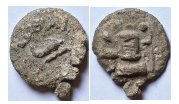
Figure 5.9 Pb token, 22 mm, 12 h, 9.43 g. Dolphin swimming right, BAL above / Uncertain image (Column (?) above rectangular object, person holding spear or sceptre on right, horse with head turned back and foreleg raised on left?) cf. Overbeck, 2001: no. 50.