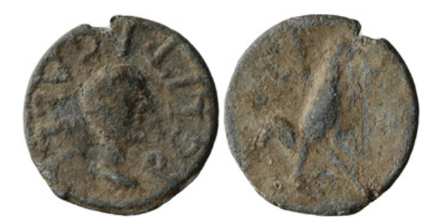
Figure 3.18 Pb token, 19 mm, 12 h, 2.66 g. Male head right, P GLITI GALLI around / Rooster standing right holding a wreath and palm branch. TURS 1238, Rowan, 2020b: no. 57.

It is thus unsurprising to find canting types on tokens of the imperial period. The token of a Publius Glitius Gallus displays the name and portrait of Gallus on one side and a rooster carrying a wreath and palm branch on the other ( gallus was Latin for rooster) (Figure 3.18). Rostovtzeff believed this was the Gallus named in the conspiracy of Piso, but another Publius Glitius Gallus is also known from the first century AD; equally this may be a third, otherwise unknown,