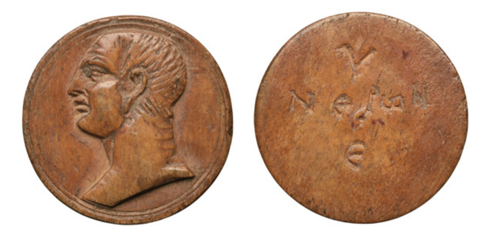
Figure 1.1 Bone gaming piece, 31 mm. Bare bust of Nero left / V | NEPWN | E.

while the other side names the image in Greek, with the number five given in both Latin and Greek. The discovery of a 'set' of these pieces in a child's tomb in Kerch in Crimea overthrew the traditional interpretation of these artefacts as theatre tickets and today they are accepted as gaming pieces, used in an unknown game. <sup>19</sup> Bone gaming pieces may also carry no imagery, or come in a variety of shapes without legends. <sup>20</sup>