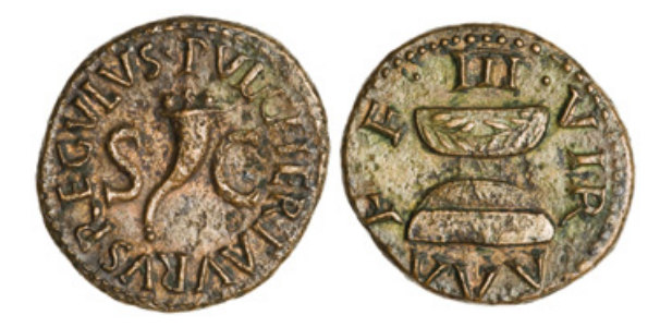
Figure 5.3 Copper quadrans , 18.5 mm, 6 h, 3.19 g, 8 BC. Cornucopia flanked by S C, PVLCHER TAVRVS REGVLVS around / Garlanded altar, III-VIR A A A F F · around. RIC I<sup>2</sup> Augustus 425.

and the lituus also appeared alongside a simpulum on quadrantes of 9–8 BC.<sup>23</sup> Of the collection of tokens published by Dressel, this type was by far the most numerous: of the 487 tokens, 205 were of this type.<sup>24</sup> Dressel suggested that the tokens found in higher numbers were those of the till owners themselves and that the other tokens, present in smaller numbers, represented the issues of others. A significant quantity of this type (139 examples) was also among the Tiber finds published by Rostovtzeff and Vaglieri.<sup>25</sup> This token issue, it seems, has survived in much higher quantity than any other. Beyond the two assemblages from the Tiber, however, no further specimens have come to light (in excavation publications or museum collections). This might be a reflection of the very small circulation area of tokens.