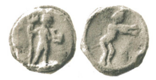
Figure 5.7 Pb token, 17 mm, no other data recorded. Neptune standing right holding trident in right hand and dolphin in outstretched left / Nude male bending at the knees with both arms outstretched before him. TURS 901.

in seeing a connection to bathing here, the design might have been intended to bring a smile to the face of the user as they 'recognised' one such annoying individual.<sup>83</sup>