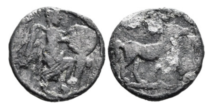
Figure 4.20 Pb token, 22 mm, 12 h, 7.88 g. Victory standing right inscribing shield that rests on a column / Horse standing right with palm branch in its mouth. TURS (Supplement) 3603.

representations of the circus include details of circus architecture. 148 One token type represents the dolphin markers that were used to count the laps of the racers, with a lion standing beneath the structure. 149 The turning posts (metae) of the circus also appear, combined with a variety of imagery on the other side of the respective tokens: the head of a victorious charioteer, clasped hands, the legend CAL, the statue of Victory atop a column that stood in the Circus Maximus, and the obelisk that stood in the centre of the track. 150 The Victory atop a column is repeatedly shown in reliefs portraying scenes from the circus. The image is also placed on a previously unpublished quadrangular lead token now in Berlin, where the image is combined with a figure placed within a distyle temple on the other side; unfortunately the token is now too worn to discern whether the structure represents a temple from the area of the circus itself. <sup>151</sup> One type, illustrated only through a line drawing, appears to show the erection of an obelisk via ropes; although Rostovtzeff included this among the tokens showing imagery connected to the Circus Maximus, there is not necessarily any reason that the obelisk shown was that in the hippodrome in Rome. 152