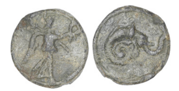
Figure 3.19 Pb token, 18 mm, 12 h, 3.28 g. Victory standing right with wreath in right hand and palm branch in left / Head of an elephant emerging from a shell right. TURS 1903, BMCRLT 810.

Some tokens carried fantastical and humorous imagery, which is also found on gems. The image of an elephant emerging from a shell, for example, is found on both media (Figure 3.19).<sup>151</sup> On the image reproduced here the design is paired with Victory; an elephant emerging from a shell is also paired with a phoenix and appears on the lead tokens of Ephesus.<sup>152</sup> A token in Berlin appears to show a rhinoceros emerging from a shell, with the legend SPE on the other side – various