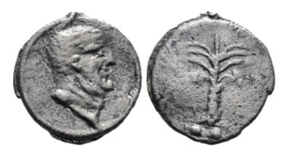
Figure 2.7 Pb token, 17 mm, 12 h, 2.95 g. Bare head of Vespasian right / Palm tree on a platform with two wheels; palm branch on left and on right. TURS 34.