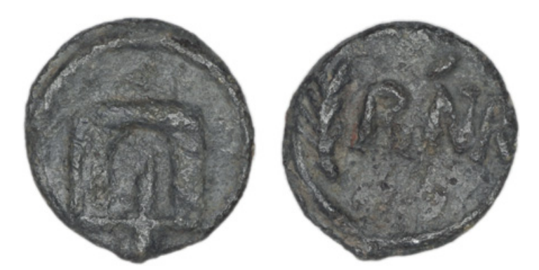
Figure 2.19 Pb token, 12 mm, 12 h, 0.89 g. Triumphal arch (surmounted by the statue of a horseman right?) / RŃR, palm branch on left. TURS 107.

On some issues there is an effort to indicate a specific arch through the inclusion of the statuary group atop the structure. On Figure 2.19 this took the form of a horseman or quadriga (the precise details on the known specimens are worn). By contrast, on the issue of SEX CL an elephant standing right was placed atop the structure.