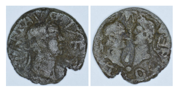
Figure 2.11 Pb token, 19 mm, 12 h, 2.74 g. Laureate head of Vespasian right; IMP AVG VES around / Laureate heads of Titus (on left) and Domitian (on right) facing each other, globe between them; IMP (ligate) above and T DO CAES below. TURS 40.