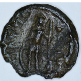
Figure 2.2 Pb token, 18 mm, 12 h, 2.48 g. Bare bust of Nero right, NERO CAESAR around / Mars (or soldier) standing left holding spear in left hand and resting right on shield, CLAVDIOR around. TURS 13.

the overall effect is very similar to the design of a coin. But the other side of the token shows Mars and bears the legend CLAVDIOR. This particular representation of Mars would only appear on Roman coinage during the civil wars of AD 68–9 and only regularly occurs on coinage from the reign of Trajan. Here the token representation predates that on official coinage. Moreover, the legend Claudior(um) , of the Claudii' , is never found on coinage. If the adjective refers to Nero (as seems likely), the piece specifically links the emperor to the Claudian gens . Nero is normally represented as the (adopted) son of Claudius ( Claudi f. ), rather than a member of the Claudii more broadly. 17