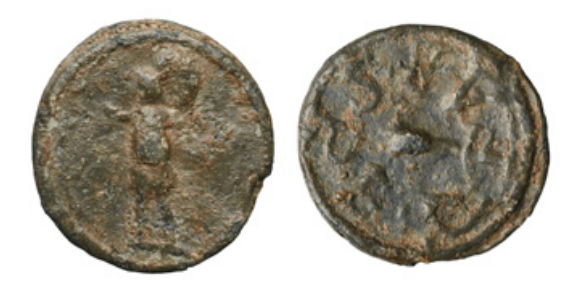
Figure 3.22 Pb token, 18 mm, 12 h, 3.21 g. Saccarius standing left holding a sack or dolium on his shoulders and with right arm raised / Q·FAB·SPE around. TURS 1033, Rostovtzeff and Prou, 1900: no. 418b.

portrayed on lead tokens accompanied by the legend AGM or OBB on the other side, or the representation of three corn-ears. 164 Although one might be tempted to link these lead tokens with the mechanics surrounding the operations of the port, these specimens are more likely to be connected to acts of communality and euergetism. 165 If we accept that the three letter legends AGM and OBB may be initials (although we cannot be certain), then three out of the four token types carrying representations of saccarii appear to carry personal names, likely advertising an act of munificence for a broader group. There is enough evidence to suggest the saccarii of Portus had joined together into a larger, more formal community - the Theodosian code mentions an organisation which might well be a collegium, corpus, sodalicium or similar association, while epigraphic evidence suggests a funerary organisation for this group of workers. 166 Commensality, for example communal banquets, would have acted as an occasion in which the identity of the group was made salient and internal hierarchies reinforced; if tokens played a role on these occasions their imagery would have served to further this process. 167 The representation of saccarii at work in numerous port scenes (e.g. carrying sacks of 'things' (res) on the Isis Giminiana fresco found in a tomb from the Porta Laurentina) demonstrates that these workers had a specific iconography, and were seen as integral to the harbour and its operations.