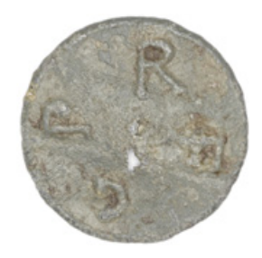
Figure 3.2 Pb token, 19.5 mm, 12 h, 2.48 g. Roma seated right holding Victory in left hand and spear in right / G P R F around. TURS 1576, BMCRLT 371.