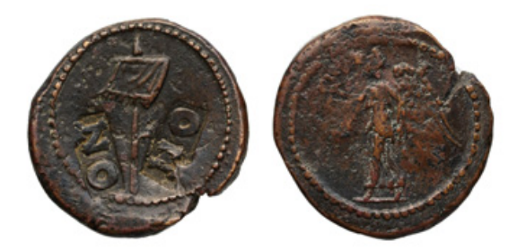
Figure 1.10 AE token, 18 mm, 6 h, 3.63 g. Vexillum , dotted border, two rectangular countermarks reading NO / Victory advancing right holding wreath in outstretched right hand and palm branch in left; dotted border. Cohen vol. VIII, 271 no. 47.