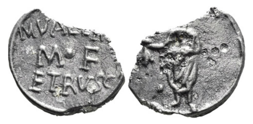
Figure 1.8 Pb token, 24 mm, 12 h, 5.04 g. M VALERI \mid M F \mid ETRVSC / Togate figure standing left holding a purse (?) in outstretched right hand. TURS 1327.

Figures 1.7 and 1.8 are one such example. The identification of token and mould was possible due to the unusual nature of the design: this is the only currently known token representation of a togate male figure holding what