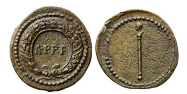
Figure 2.16 AE token, 18 mm, 2.72 g, 7 h. A·P·P·F within wreath. Dotted border / Bust-topped sceptre left. Dotted border. Rowan, 2020b: no. 21.

on a token carrying a portrait of Augustus with the legend FEL beneath (Figure 1.2). 115