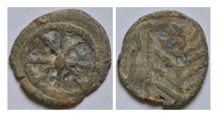
Figure 3.25 Pb token, 21 mm, 12 h, 4.43 g. Wheel with eight spokes / Whip on left, next to palm branch on right. TURS 832.

Several of the tokens from these baths specifically reference the work of the cisiarii . Three tokens found in the baths were of the same type, carrying a wheel on one side and a whip on the other, a reference to the cisium the drivers used, and the whips they carried (indeed, they are pictured carrying whips in the mosaic in the bathhouse). A token of the same design is shown in Figure 3.25; the addition of the palm branch next to the whip expresses the same sense of festivity that other decorative motifs in the baths capture. Two further tokens were found with the legend CI|SI on one side and an amphora on the other; the legend likely refers to the cisiarii or the bathing establishment. Is It seems probable that these particular tokens were connected with the cisiarii in some way, an expression of identity through work as also seen on the mosaic in the bathhouse. Cisiarii are also represented at work driving their carriages on tombstones elsewhere in the