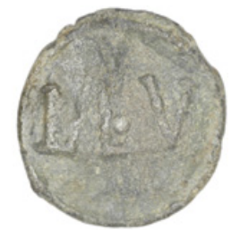
Figure 2.10 Pb token, 19 mm, 12 h, 3.06 g. Nude male figure standing left holding cornucopia in left hand and reaching out with right to palm tree before him / LLV. TURS 3194.