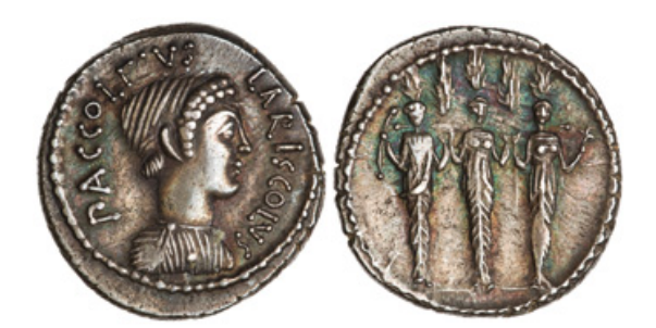
Figure 3.26 AR denarius, 1 h, 3.82 g. Bust of Diana Nemorensis right, draped; P-ACCOLEIVS LARISCOLVS around. Border of dots / Triple cult statue of Diana Nemorensis (Diana, Hecate and Luna) facing; behind, cypress grove. Border of dots. RRC 486/1.

Four tokens found at Nemi carry the representation of three female figures standing frontally with their arms raised. Two specimens carried the legend COR | THAL on the other side; one reported by Catalli and another found as a stray find near the lake in the nineteenth century. A further two tokens with this imagery bore the legend APOL within a wreath on the other side; both were found during the