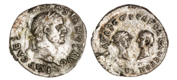
Figure 2.12 AR denarius, 17.5 mm, 6 h, 3.22 g. Laureate head of Vespasian right, IMP CAESAR VESPASIANVS AVG around / Bare head of Titus on left facing bare head of Domitian on right, CAESAR AVG F COS CAESAR AVG F PR around. RIC II.1<sup>2</sup> 16.

the token and the coin. Both Titus and Domitian are shown laureate on the token, with the ties of the wreath flowing down behind their necks. By contrast, both are bare headed on the coin issue. A globe is also placed between the busts on the token, reminiscent of a brass token showing the twin sons of Drusus the Younger, Tiberius Gemellus and Tiberius Germanicus, whose facing busts also had a globe placed between them. The placement of the IMP and CAES on the token is ambiguous: the IMP likely only refers to Titus, but its association with Domitian cannot be ruled out (especially since Domitian is laureate); both Domitian and Titus also bore the name Caesar. In sum, the token takes numismatic imagery to a different level: the temporary nature of the medium, created for a particular (presumably receptive) audience at a particular moment in