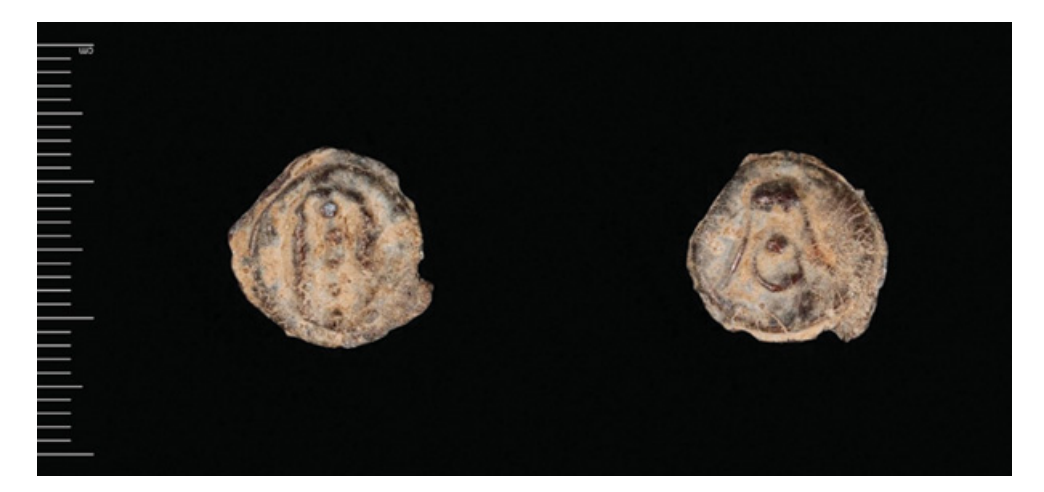
Figure 5.10 Pb token, 14.7 mm, 12 h, 3.51 g. Long oval object decorated with five pellets / Ring with two strigils hanging down on either side of a container of oil ( aryballos ). TURS 563.

Of course, as has already been revealed by the discussion of the tokens in the baths of the Cisiarii in Chapter 3, other imagery may equally have been used on tokens within a bathing context. It is hoped that future finds may further elucidate the situation. However, the combination of bathing imagery with legends that may be abbreviations of names (e.g. S, MOF, PVR), the use of festive imagery on Figure 5.8 and, above all, the tiny quantities in which these tokens survive, suggests that euergetism is a likely context for their use. If tokens acted as entry tickets for bathhouses on any regular basis, one would imagine we would find them in much larger quantities. If, however, these items were used to facilitate occasional acts of euergetism (free entry, gifts of oil, or other goods), then their limited occurrence in the archaeological record can be better understood. Indeed, if lead tokens were used in a variety of euergetic acts (e.g. food distributions, banquets, bathing), then they form an important (and recurring) part of the material tradition of this practice within central Italy.