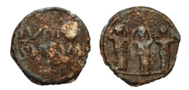
Figure 3.27 Pb token, 19 mm, 12 h, 4,15 g. L VOLV|SI PRIMI ( L. Volusi Primi ) / Three women standing frontally with arms raised. TURS 1345, Rostovtzeff and Prou, 1900: no. 430f1.

But the image is also unlikely to be a representation of the cult statue of Diana Nemorensis. The same image, of three women standing frontally, each with their hands raised, is also found on a variety of other tokens, many without connection to Nemi (e.g. Figure 3.27). This image is variously labelled as 'Hecate' or the 'Three Graces' in Rostovtzeff's catalogue, although the image is the same. Hecate is also an unsatisfactory interpretation of the image, since Hecate is normally shown via three female figures standing back-to-back as 'Hecate triformis ', even on coinage and on tokens.<sup>200</sup> Moreover, lead tokens also carry the image of two women standing frontally with their arms raised, which Rostovtzeff suggested was a representation of two aurae (winds).<sup>201</sup> What is a more likely interpretation of all these representations is that they show women with their hands open and arms