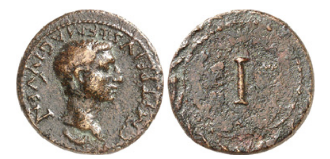
Figure 1.4 AE token, 19 mm, 3.61 g, 6 h, 27 BC – AD 57. Bare male head right, cornucopia (?) below, C. MITREIVS L. F. MAG. IVVENT around (NT ligate). Dotted border (same die as Figure 1.5) / I within dotted border within wreath.

Both sets of Mitreius' tokens carry numbers, but in different ways; one might see here two series. For one series an existing set of dies within the workshop were used (the numbers within wreath), while for the other series a different reverse design was desired, the basilica. Since this necessitated the creation of a new reverse die, the series was produced from one die