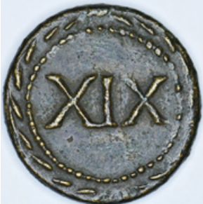
Figure 4.12 Orichalcum token, 19 mm, 9 h, 4.54 g. A togate figure in a triumphal quadriga right holding a sceptre in left hand and with right hand outstretched, being crowned by a monkey who stands behind; all on a camel / XIX within dotted border within wreath. Buttrey, 1973: B25 XIX.