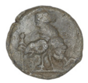
Figure 3.20 Pb token, 19 mm, 12 h, 5.73 g. Helmeted bust right of Roma or Minerva right / Fantastic creature with the head of a horse, legs of a rooster, mask of Silenus on the right side, and a ram's head on the left; sceptre behind. TURS 2897, BMCRLT 343.

animals emerging from shells served as a popular motif for gems. <sup>153</sup> The gryllus or caricature is also found on tokens, consisting of a creature with the head of a horse, legs of a rooster and a body made up of a mask of Silenus and a ram's head (Figure 3.20). The same image is also known from gems. <sup>154</sup> These fantastical representations fall into the same category as other comical and absurd imagery, for example mice in chariots. Although the humour of these representations might have appealed to the owners of these pieces, the imagery also had the potential to serve an apotropaic function. <sup>155</sup> The imagery chosen for intaglios and tokens therefore might simultaneously communicate a particular identity and protect the individual concerned. These images may also have expressed a desire for prosperity, similar to the imagery of Fortuna and Mercury mentioned above. <sup>156</sup>