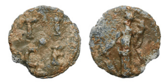
Figure 5.19 Pb token, 18 mm, 12 h, 3.09 g. TI|CE / Fortuna standing left holding cornucopia in left hand and rudder in right. TURS 1502, Rostovtzeff and Prou, 1900: no. 430a.