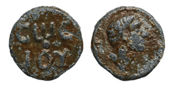
Figure 3.21 Pb token, 19 mm, 12 h, 4.96 g. CWC|IOY / Bare male head right (Gaius Sosius?). TURS 1319, Rostovtzeff and Prou, 1900: no. 432.

a bare male head facing right, accompanied by the legend CWC|IOY on the other side. Rostovtzeff identified this as the Gaius Sosius who originally served as a general of Marc Antony before defecting to Octavian and who was responsible for the temple of Apollo Sosianus in Rome. The style of the portrait is appropriate for the time period of Sosius' life; indeed, the image is reminiscent of the upward-gazing portraits of Alexander the Great. The choice of Greek for these tokens was not only a statement of identity on behalf of the issuer, it was also a statement made by the creator of the token for his audience: the users of these pieces presumably also knew Greek (or else would have known enough to have been suitably impressed by the appearance of Greek in this context).