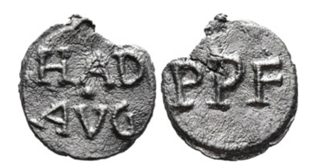
Figure 2.17 Pb token, 18 mm, 12 h, 3.04 g. HAD | AVG / PPF. TURS 66.

Festive occasions that utilised tokens may have also included the dies imperii , the anniversary of the day an emperor came to power. An antiquarian report on the collection of Capranesi found in Rome records the existence of a token that bore the legend DIEI | IMPE|RI on one side and HADR | AVG | FEL on the other – a wish of good fortune ( fel(iciter) ) for Hadrian Augustus on his dies imperii . Other token types also communicate good wishes for Hadrian and Sabina. Figure 2.17, for example, expresses good fortune (F) for Hadrian Augustus (HAD AVG), father of his country (PP). Another token issue carries the legend FEL | SABI on one side and the legend AVG | HADR | SAL on the other. Here the FEL likely