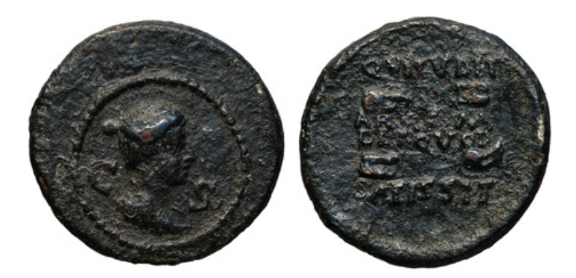
Figure 4.13 AE token, 25 mm, 7 h, 8.64 g. Female bust right, with hair tied in a bun behind her head. C on left side, S on right. Dotted border / Four knucklebones, two on top of the other. QVI LVDIT above, ARRAM | DET QVOD in the middle between the knucklebones, SATIS SIT below. Cohen vol. VIII, 266 no. 5.

S ( ortis ) – but this remains speculation. <sup>93</sup> A further lead token may also refer to knucklebones: TURS 1381 carries the legend ASTRAGALVS around in a circle on one side and a palm branch and club on the other; Rostovtzeff, however, suggested that this legend be understood as a name.