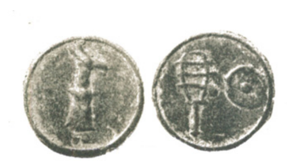
Figure 4.5 Pb token, 18 mm. Mask of Anubis right / Sistrum on left, next to patera on right. TURS 3206.

Particular paraphernalia connected to Egyptian cults are also shown on lead tokens. Figure 4.5 appears to show the physical mask of Anubis worn by the anubophoroi ; the sistrum carried by worshippers of Isis is shown on the other side. Rostovtzeff believed Figure 4.6 was connected to the Isidis Navigium , noting that Apuleius reported among the attributes of the gods carried in the procession was a 'deformed left hand with palm extended', which was a symbol of justice. <sup>43</sup> There is not any reason to connect the representation of a left hand with the cult of Isis, however. As with Figure 3.8, the hand may symbolise something else, for example a particular numeral.