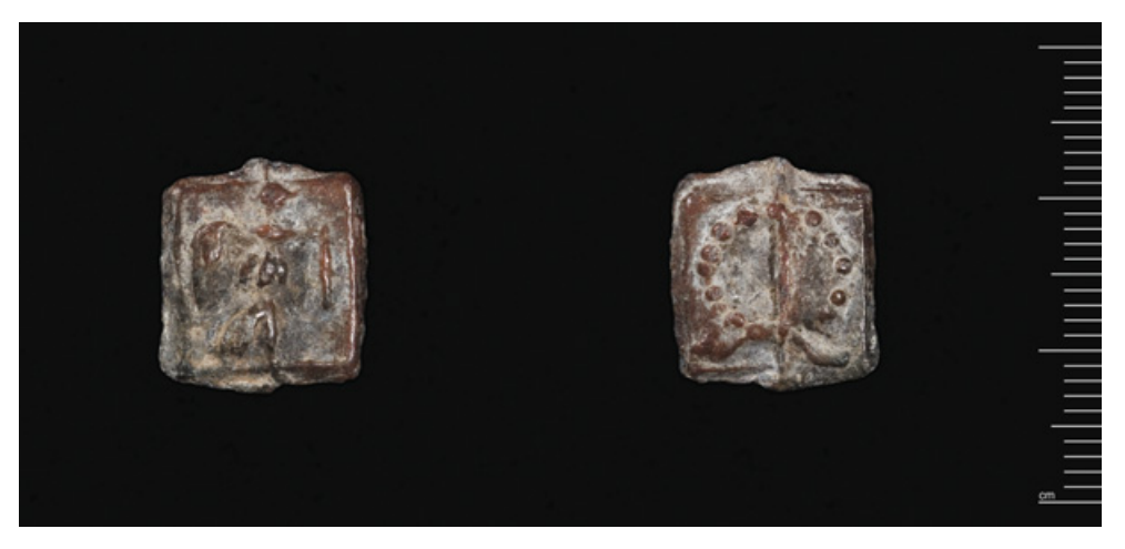
Figure 1.9 Pb token, 15 \times 14 mm, 12 h, 4.61 g. Victory standing right / Wreath. TURS 1913.

appears to be a purse. The other mould half does not survive, one presumes this was the half that contained the channels for the lead to flow through to the cavities, since these do not exist on the piece we possess. That tokens survive and not their moulds, or vice versa, is a reflection of the partial survival of material from antiquity, particularly in the case of cheaply manufactured everyday goods. But the low survival rates may also reflect the use context of these tokens. As will be explored throughout this volume, lead tokens appear to have been manufactured for use in a particular moment in time, for a specific event or benefaction. One presumes that the lead tokens would normally have been melted down after use; those that survive seem to have escaped their normal life course through accidental loss or curation. It is also perhaps no accident that normally only a single mould half is found: moulds may have been reused, or disposed of in such a way to prevent forgery.