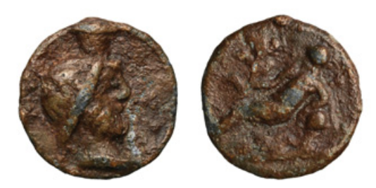
Figure 4.7 Pb token, 17 mm, 12 h, 3.64 g. Head of Sarapis wearing modius right / River deity reclining left, leaning on urn from which water flows with left arm and holding long reed in right. TURS (Supplement) 3731, Rostovtzeff and Prou, 1900: no. 646.