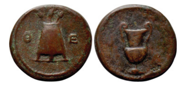
Figure 5.17 AE token, 19 mm, die axis not recorded, 3.41 g. Modius with three corn-ears, \Theta on left, E on right / Cantharus, dotted border. Ex BCD collection.

one wonders whether this is how we are to understand \Theta E here, but without a bath find context (as on the Ephesian token) any suggestion can only be speculative. Either these tokens were required in such quantity that multiple dies were needed during a single production, or else production was occasional, with different dies being engraved over time. A full die study may assist in coming to a definitive conclusion. Unfortunately, the