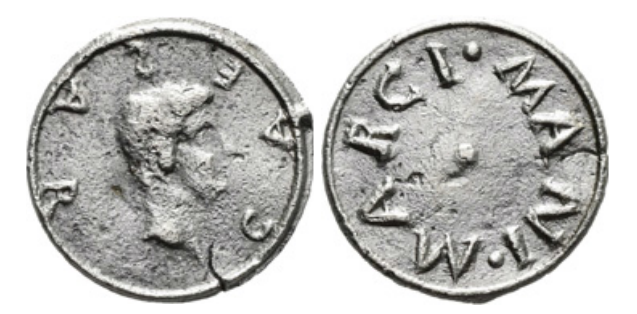
Figure 2.3 Pb token, 19 mm, 12 h, 1.7 g. Bare male head (Augustus?) right, CAESAR around / MARCI-MANI- around. TURS (Supplement) 3601 (previously unpublished).

Other tokens carrying imperial portraits, however, are issued by individuals whose magistracy is specified; this is often a curator or magister .<sup>20</sup> The occurrence of curator (frequently abbreviated to CVR on tokens) was