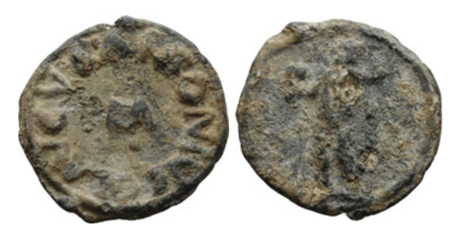
Figure 3.13 Pb token, 20 mm, 6 h, 4.26 g. M in the centre of the token, ANTONIVS GLAVCVS around / Vulcan standing left holding sceptre in left hand and mallet in right. TURS 1127, Rowan, 2020b: no. 55.

the imagery of a person's seal (or glass paste) might be used to reference a particular individual. In general, with a few exceptions, the individuals named on tokens are not otherwise known. This is unsurprising: tokens generally appear to have been issued by lower magistracies in charge of games and distributions, as well as individuals involved in communal associations, bathhouses or other commercial establishments. The corpus of material thus provides an invaluable insight into individuals from the Roman world who are otherwise absent from the remaining historical record.