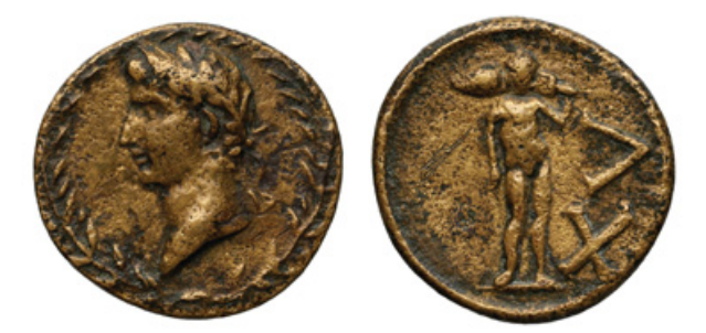
Figure 3.23 Orichalcum token, 20 mm, 5 h, 7.3 g. Laureate head of Augustus left, within wreath / Saccarius standing front holding an amphora over his shoulder; XV in field right. Cohen vol. VIII, 254 no. 101, BnF 16979.

An orichalcum token also shows a saccarius carrying an amphora over his shoulder (Figure 3.23). <sup>168</sup> The issue is part of a broader series of orichalcum tokens (including the so-called spintriae ) issued during the Julio-Claudian period, likely by a workshop in Rome that produced pieces for a variety of individuals or groups. <sup>169</sup> The saccarius is nude and decidedly more heroiclooking than on the lead token, although amphora-carrying saccarii are also shown nude on marble reliefs. Figure 3.24, for example, shows nude saccarii each carrying an amphora off a ship. The porters walk towards three officials, one of whom gives the rightmost saccarius an object. The object was thought by Rickman to be a token; he suggested this was a method of ensuring the number of amphorae leaving the ship was the same as that entering the warehouse. <sup>170</sup> The precise shape of the object is difficult to discern, but it does not appear to be a small circular token; rather it seems a longer, more rectangular object.