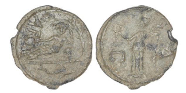
Figure 3.5 Pb token, 19 mm, 12 h, 2.43 g. River god reclining left, left arm leaning on urn from which water flows; reed on right curving above the god's head, dolphin swimming right below. ARA around on left / Victory, standing left with wreath in extended right hand and palm branch in left. C on left, ligate VR on right. TURS 526, BMCRLT 768.

This is evident from the series of coins struck under Nero showing the harbour at Ostia with a reclining deity placed at the bottom of the scene (Figure 3.6). This figure is identified in the RIC as the river Tiber holding a rudder and reclining on a dolphin. But the dolphin is more often used to reference the ocean. As a result, the reclining figure on Nero's coinage has convincingly been re-identified as a personified representation of the