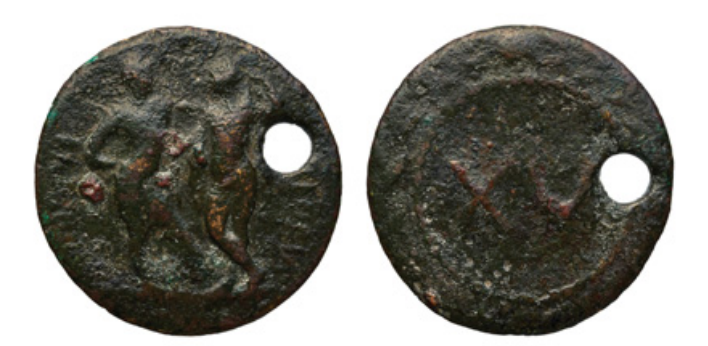
Figure 5.6 AE token, 22 mm, 6 h, 3.62 g. Male figure on left standing with right hand on hip, facing Dionysus (?) on right, who leans on thyrsus with left hand and has right leg crossed in front of the left, worn legend around / XV within dotted border within wreath. Cohen: vol. VIII, 266 no. 9.

side.<sup>79</sup> Campana, noting that these pieces appear to be concentrated in one European collection, and that they have a regular die axis of 12, suggested that they were more modern creations, made during the Renaissance or even later.<sup>80</sup> These tokens are certainly of a different style to the orichalcum pieces carrying imperial portraits and other designs that are securely dated to the Roman imperial period.