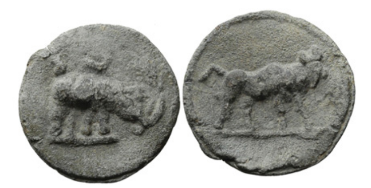
Figure 2.13 Pb token, 23 mm, 6 h, 5.6 g. Rhinoceros with two horns standing right; crescent above / Bull walking right. TURS 645.

This token series, and other tokens carrying the image of a two-horned rhinoceros, may have been used during the games held by Domitian in which the rhinoceros appeared, or the imagery may have been appropriated for occasions after the event. On gems and intaglios the rhinoceros was a symbol that communicated victory. <sup>100</sup> In addition to the bull, the rhinoceros with two horns is paired with a bison and a rooster (carrying a wreath in its beak) on tokens. <sup>101</sup> Four specimens of the rhinoceros / rooster type were found in the Tiber river in Rome; the rooster may reference Mercury. <sup>102</sup> On another type the legend AVR is placed above the rhinoceros and a palm branch is depicted on the other side. <sup>103</sup> One type carries the image of a rhinoceros with a single horn, but has a palm tree on the other side, suggesting a possible connection with the Flavian victory in Iudaea. <sup>104</sup>