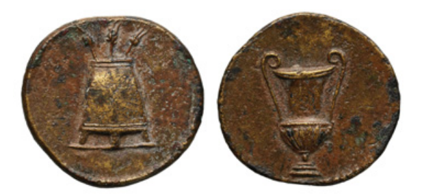
Figure 5.15 Orichalcum token, 19 mm, 6 h, 2.83 g. Modius with three corn-ears, dotted border / Cantharus, dotted border. BnF inv. 17070.