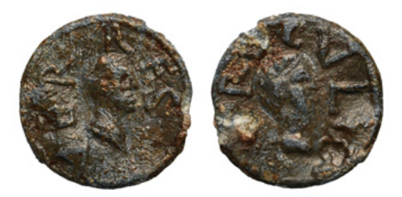
Figure 3.15 Pb token, 18 mm, 12 h, 3.16 g. Male bust right, VERRES around / Male bust right, PROCVLVS around. TURS 1332, Rostovtzeff and Prou, 1900: no. 427b.

Male portraits might also appear without an identifying legend. Pairs of individual portraits (male-male or male-female) also appear on the same side of a token facing each other. These tokens formed statements of