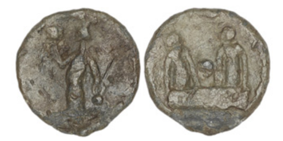
Figure 4.8 Pb token, 17 mm, 12 h, 3.25 g. Isis or worshipper of Isis standing left holding sistrum in raised right hand and situla in left / Two figures on a rectangular object. TURS 3179, BMCRLT 1286.

a baboon and the eagle form of the god Horus.<sup>47</sup> One of the more peculiar representations is reproduced here as Figure 4.8. This token shows Isis or a worshipper of Isis on one side and on the other side two figures on a rectangular object. What scene the image is meant to capture remains unknown. Egyptian imagery is also paired with other iconography: Mercury, for example, Fortuna, or a dolphin.<sup>48</sup> Each occurrence of Egyptian iconography thus cannot necessarily be connected to a particular Egyptian cult or festival; Sarapis, for instance, might have been used on tokens for other contexts.