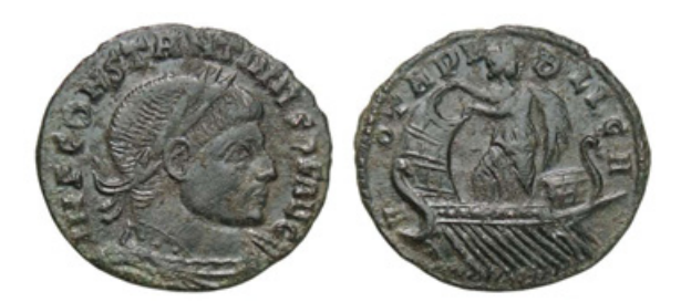
Figure 4.2 Bronze token, 19 mm, 12 h, 2.38 g, AD 317. Laureate bust of Constantine I right, IMP CONSTANTINVS P F AVG / Isis Pharia standing on a ship left, VOTA PVBLICA. Ramskold 2016: no. 33, pl. 1.

It has long been thought that a series of bronze tokens, as well as associated coin fractions, were produced in conjunction with this festival in late antiquity (Figure 4.2).<sup>11</sup> It is not only the late date that separates these particular tokens from those that form the focus of this volume. These late antique pieces were issued officially by the mint (not by private individuals) and are extremely similar to the official small change produced at this time. Some tokens of this category carried obverse imagery of deities, while others possessed obverses that carried portraits and legends naming Roman emperors. In the latter case, the same obverse dies used for official currency were utilised, confirming the hypothesis that these were produced at the mint of