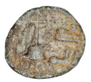
Figure 4.1 Pb token, Athens, 18 mm, 4.72 g, Hellenistic period. A ship's stylis on a cart (the 'cart of Dionysus') being drawn by two horses right; prow above. Gkikaki, 2020: cat. no. 21.

Gkikaki; during this festival Athena's peplos was suspended on the mast of a ship and brought to the foot of the Acropolis.<sup>3</sup>