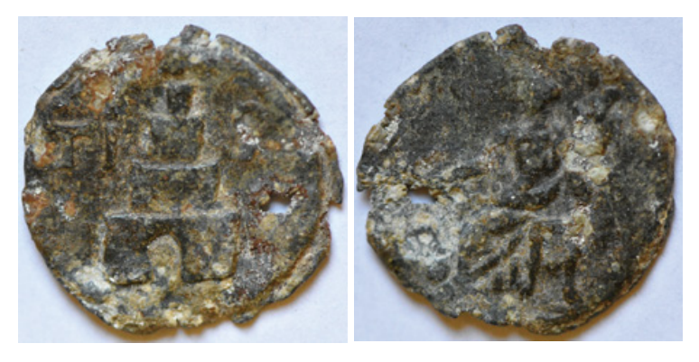
Figure 3.10 Pb token, 24 mm, 12 h, 5.69 g. Lit lighthouse of four tiers, TI on left, S on right / Fortuna seated left holding cornucopia in left hand and rudder in right. TURS 61.

that Ostian civic identity must have incorporated the harbour, initially built under Claudius and then enlarged under Trajan, when it became known as the Portus Trajani .<sup>76</sup>