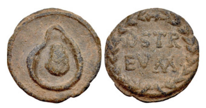
Figure 2.5 Pb token, 21 mm, 3.18 g. Oyster on an oyster shell / OSTREVM in two lines within wreath. From a private collection, Dalzell, 2021: 88 no. 2.

thus do not survive to the present day. Upon presentation and exchange, one imagines the tokens were then melted down to allow the lead to be reused.