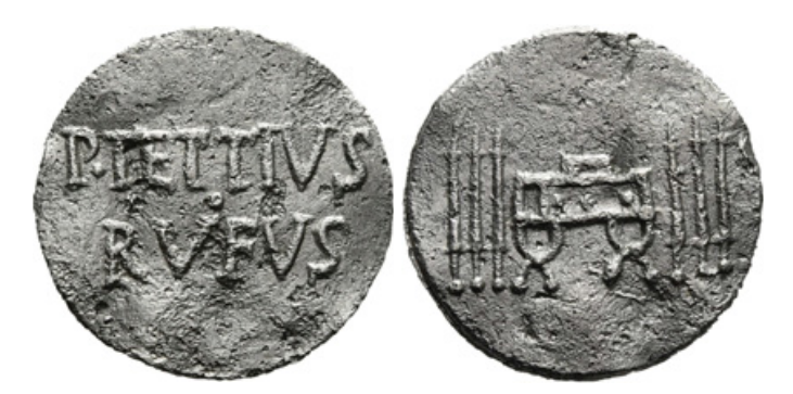
Figure 3.16 Pb token, 22 mm, 12 h, 2.78 g. P·TETTIVS | RVFVS / Curule chair with three fasces on either side. TURS 517.