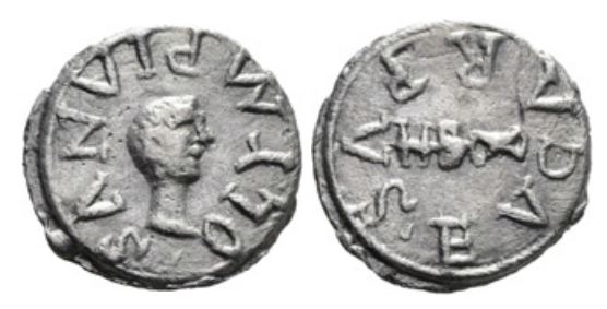
Figure 5.1 Pb token, 17 mm, 12 h, 3.95 g. Male bust right, OLYMPIANVS around / EVCARPVS around HS ∞. From the Tiber. TURS 1460.

volume, tokens might be utilised in a variety of ways. Some of these roles do overlap with the functions of money. Tokens could represent a particular value (i.e. a product or experience that was worth a certain amount), and, if issued in advance, form a type of credit. The findspots of tokens across Rome, Ostia and elsewhere (discussed in more detail below) do suggest that at least some were issued before a particular occasion or benefaction. An exploration of the use of tokens in the medieval period has demonstrated that they might act as IOUs to defer expenditure, or as a form of payment in kind rather than cash. Some Roman tokens may have functioned in a similar way (with patrons issuing clients or customers tokens to be exchanged for goods rather than money), but there is no surviving evidence to confirm this was the case. This chapter explores the potential economic roles of tokens in Roman Italy, and the extent to which these objects facilitated the functioning of micro economies.