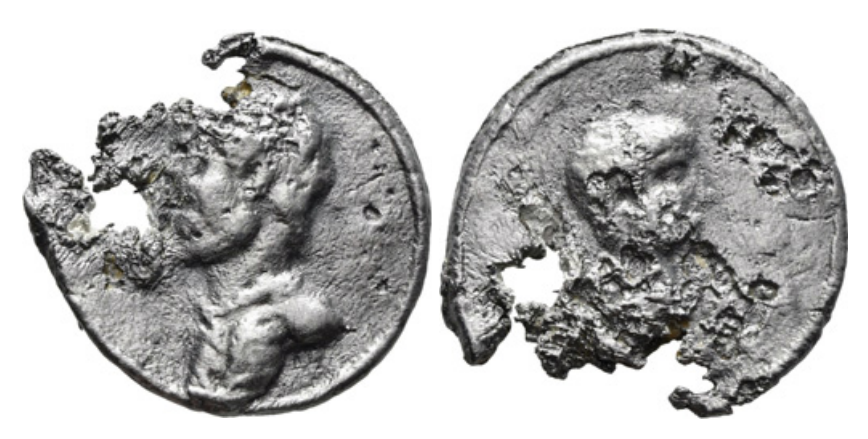
Figure 2.21 Pb token, 27 mm, 6 h, 11.08 g. Bearded bare male bust (of an emperor?) left / Bare young male bust (Galerius Antoninus?) right. TURS 71.

Another, now damaged, token carries two male busts (one on each side): Rostovtzeff identified these as second century in date, and suggested one was likely an emperor of the Antonine age, with the other perhaps Galerius Antoninus, the son of Antoninus Pius who died before his father ascended to the throne (Figure 2.21). Galerius also appears on select provincial coins, but given the preservation of the token and the lack of an identifying legend it is difficult to make a concrete identification. <sup>155</sup> A clear portrait of Antoninus Pius (without an identifying legend) can be found on a token now in the BnF; on the other side of the token is the worn legend VNISATIS around in a circle. The meaning of the legend is not clear. <sup>156</sup>