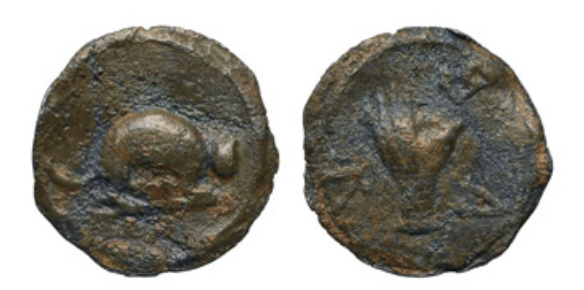
Figure 4.6 Pb token, 18 mm, 12 h, 2.14 g. Cat (?) crouching right / Left hand, ABR (retrograde) around. TURS 3185, Rostovtzeff and Prou, 1900: no. 446b.

The imagery selected from the broader repertoire of Egyptian cults for use on tokens in Rome and Ostia is surely significant: the iconography is predominantly associated with festival processions or worshippers. Several representations of Isis found on Roman imperial coinage are absent on tokens: the goddess holding a sistrum and sceptre seated on a dog leaping right (the image most closely connected with the temple of Isis in Rome), for example, and Isis suckling Horus (connected with the fecundity of the empresses on coinage). This may be because the tokens were utilised within a particular cultic community (or communities); imagery was chosen to reflect the experiences of the members rather than broader ideology. It is also worth mentioning that the imagery chosen for these tokens also differs significantly from the imagery on tokens within the province of Egypt itself: here deities of local and regional significance dominate, with the river god Nilus particularly popular.