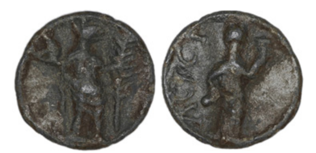
Figure 4.4 Pb token, 19 mm, 12 h, 3.05 g. Anubis (or priest of Anubis) draped from the waist down, holding branch in left hand and caduceus in right / Isis (or priestess of Isis) standing right holding sistrum in upraised left hand and situla in right, ACICI along on the left. TURS 3190, BMCRLT 16.

Several lead tokens from Rome and Ostia carry the representation of a male figure with the dog-shaped head of Anubis holding a caduceus and long palm branch (Figure 4.4).<sup>32</sup> An Anubis figure also appears on the vota publica tokens of late antiquity; Ramskold argues that when Anubis appears on these pieces in military dress holding a branch, the god himself is represented, while the presence of a palm branch and drapery indicates the depiction of an anubophorus .<sup>33</sup> By this reasoning, the Anubis shown on the earlier lead tokens is the depiction of a priest, since the figure always appears with a long palm branch. But there did not seem to be such a distinctive iconographic division between Anubis and the anubophoroi in the earlier Roman period: representations of what is believed to be Anubis himself on