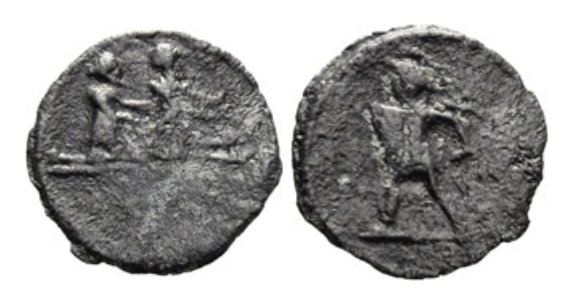
Figure 4.16 Pb token, 17 mm, 12 h, 1.32 g. Two spectators applauding right / Gladiator standing left with shield in left hand and sword in right. TURS 537 variant (no fly).

octoiugus on the other ( TURS 31), but unfortunately the surviving specimens are not well preserved enough to judge whether they might be the products of the same workshop. The token carrying representations of spectators and a ship (perhaps a reference to a naumachia ?) survives as a single specimen now preserved in the British Museum; it bears a rectangular countermark beneath the spectators that reads IMP – a reference to the emperor (who would have been one of the few individuals with the resources to stage such a spectacle).<sup>116</sup>