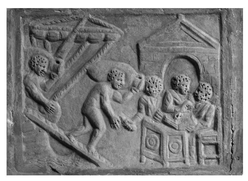
Figure 3.24 Marble relief showing saccarii offloading amphorae from a ship, 43 \times 33 cm. Found in Portus, now in the Torlonia collection (inv. no. 428).

a statue at Perinthus) suggests this group was wealthier than scholarship has traditionally thought. The token and the relief, then, might have been created by one of the saccarii , or else the physical identity of these workers was utilised by another group to communicate a port scene, or the abundance of supplies their work ensured.