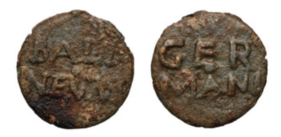
Figure 5.4 Pb token, 18 mm, 12 h, 4.09 g. BALI|NEVM / GER|MANI. TURS 886. Rostovtzeff and Prou, 1900: no. 415b.

Other tokens types carry the legend BAL, thought to be an abbreviation of balineum or balneator. 62 TURS 888, for example, carries the legend BAL on one side and the legend TIC|ILL on the other. In his catalogue, Rostovtzeff suggested the legend might be understood as Bal(ineum) Ti. C(laudi) Ill(ustris) or similar. More recently, Bruun has suggested the type may have referenced the balneum Tigellini, an establishment also mentioned by Martial.<sup>63</sup> Quite often the rendering of G on Roman lead tokens looks very close to (or indeed the same as) a C, so the suggested reading is very plausible. Indeed, on the specimen now in the Museo del Castelvecchio of Verona, the letter does appear to be a G.64 The individual named may be the Tigellinus who acted as praetorian prefect under Nero.65 A bal(ineum) nov(u)m is also mentioned on lead tokens (TURS 887). Rostovtzeff believed that a token carrying the legend L·DOMITI·PRIMIG, accompanied by the image of an amphora of oil and a jug, referenced the bathing establishment of one Lucius Domitius Primigenius (the other side of the token issue was decorated with a ring from which strigils and an ampulla were suspended). 66 The existence of a name consisting of a tria nomina and the absence of the letters BAL on this series leaves open the possibility that these tokens may have been issued as part of a bathing benefaction