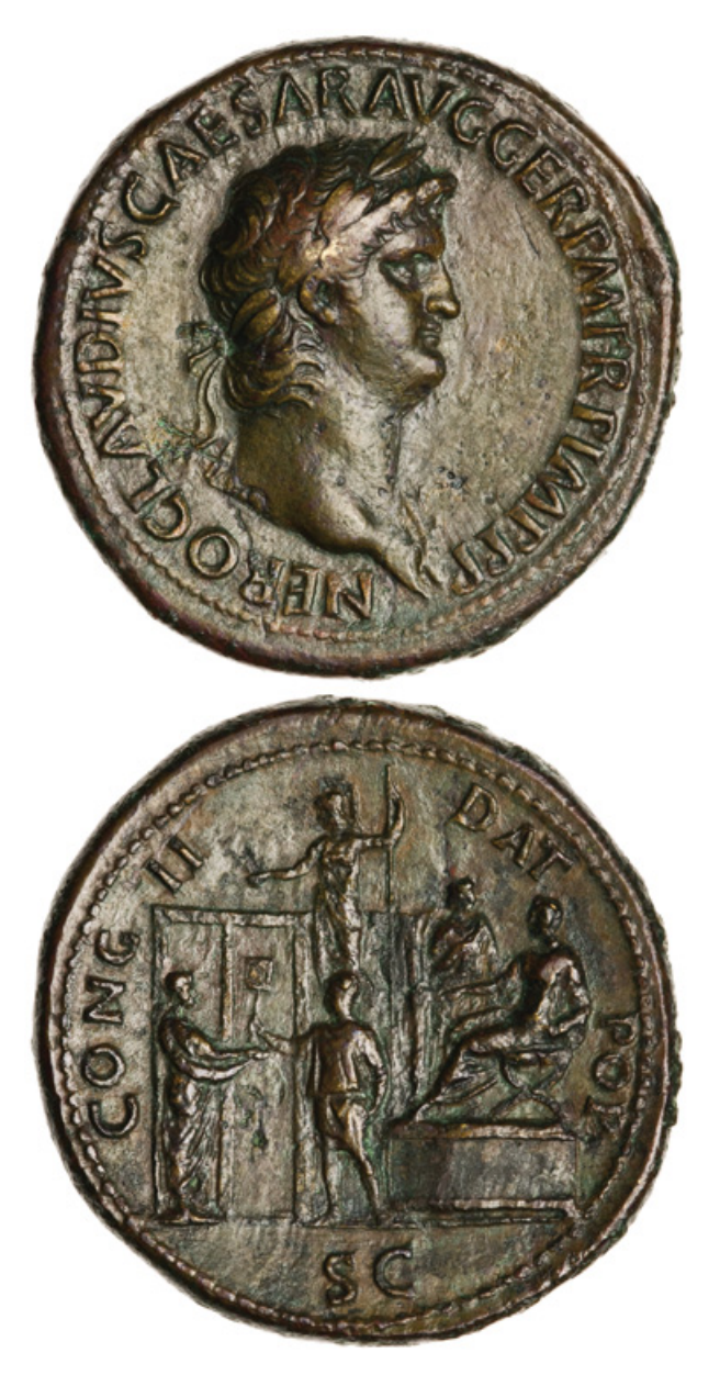
Figure 2.22 AE sestertius, 40 mm, 6 h, 26.16 g. Laureate head of Nero right with aegis on his neck, NERO CLAVDIVS CAESAR AVG GER P M TR P IMP P P around / Nero, bare-headed and togate, seated left on platform; praefectus annonae standing behind; in front, attendant standing left, giving distribution of coins to citizen right; statue of Minerva facing left behind holding owl and spear; tetrastyle building to left, CONG II DAT POP S C. RIC I<sup>2</sup> Nero 160.