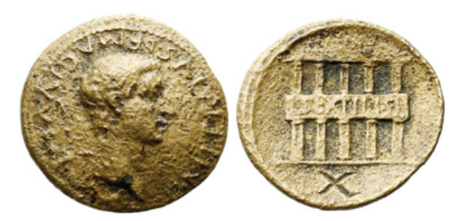
Figure 1.5 AE token, 20 mm, 3.58 g, 6 h. Bare male head right, cornucopia (?) below, C. MITREIVS L. F. MAG. IVVENT around (NT ligate). Dotted border (same die as Figure 1.4) / A two-storey building with five columns on each floor (basilica?) and a curved roof. On the building, between each floor, L. SEXTILI- S.P. In the exergue, X incised. Rowan, 2020b: no. 10.

and then engraved with numbers after production – for what seems to have been an exceptionally small volume (less than c. ten specimens are known to the author), this was far cheaper and easier than producing a die for each number required.