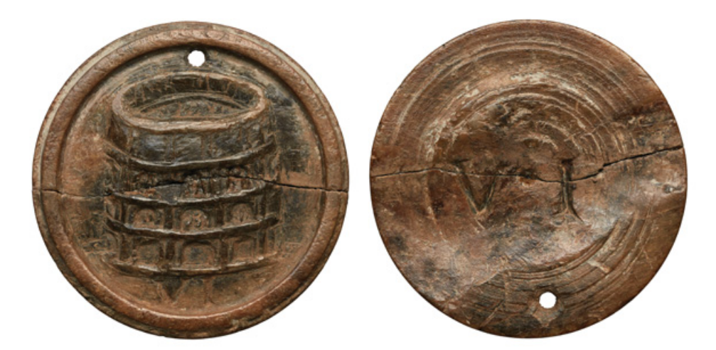
Figure 2.14 Pierced bone gaming piece (?) showing the Colosseum on one side and VI incised on the other. Froehner 282.

Bone gaming pieces often carry a number on one side, as on Figure 2.14. The mention of a twelfth consulship, and the absence of a number, would make the piece published by Overbeck unusual if it were a gaming piece. A similar bone piece, with no image and only a legend, is in the David Eugene Smith collection in Columbia University. One side carries the engraved legend L·LVCIVS·CONS·II and the number II is engraved on