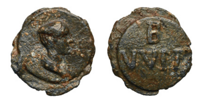
Figure 3.14 Pb token, 22 mm, 12 h, 8.09 g. Female bust right / B|VVPP. TURS 1546, Rostovtzeff and Prou, 1900: no. 439a.

Hemelrijk's study of female patronage demonstrated that, like their male counterparts, women had reduced opportunity for the very prominent