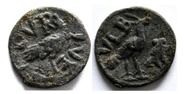
Figure 5.11 Pb token, 19 mm, 10 h, 3.72 g. Eagle standing right with head turned back left. CVR above left, IVE on the right / Peacock and owl standing right with closed wings, VLB above left. TURS 869, Rostovtzeff and Prou, 1900: no. 247c.

Excavations along the via dei Vigili uncovered a lead token showing Fortuna on one side and P within a wreath on the other ( TURS 2226). The fullonica flanked by the via di Fullonica and via delle Corporazioni furnished a bronze token carrying a palm branch on one side and a figure within a double wreath on the other. The excavations of the Piazzale delle corporazioni to the west also uncovered tokens and token moulds.