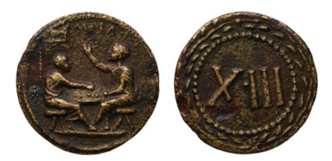
Figure 4.14 Orichalcum token, 21 mm, 5.04 g. Two boys or men seated facing each other, a tablet on their knees, playing a game. The figure on the right has a raised right hand. At the left a cupboard or doorway (?); MORA above / XIII within dotted border within wreath. BnF AF 17088.

representation on Figure 4.14 doesn't seem to carry the same sense of humour, and is perhaps closer in intent to the more straightforward representation of dice playing in the fresco of another bar, that on the Street of Mercury in Pompeii. The frescos and the token possess imagery that invites an emotional response from the viewer, designed to evoke a particular atmosphere of fun, diversion and leisure. Depending on when the token imagery was seen, the viewer might anticipate leisure immediately ahead of them, or be prompted to reminisce about previous gaming experiences.