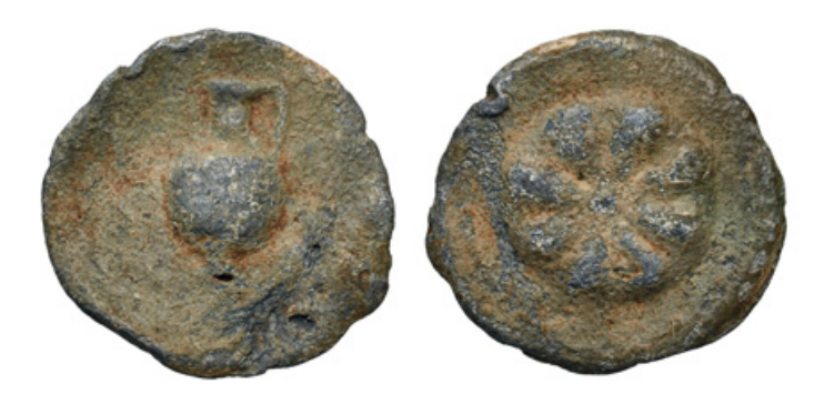
Figure 4.23 Pb token, 23 mm, 12 h, 6.21 g. Vessel with handle / Loaf of bread seen from above. TURS 1021, Rostovtzeff and Prou, 1900: no. 609.

The same idea is captured on tokens that carry variations of a cantharus and modius , or other vessels that contained grain, wine or oil. An orichalcum issue is known that contains a cantharus on one side and a modius on