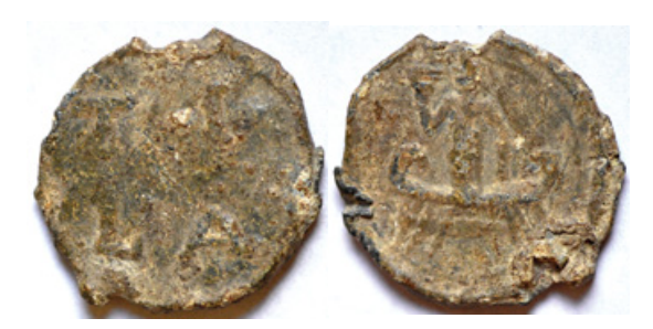
Figure 4.3 Pb token, 18 mm, 12 h, 3.21 g. TI|LA / Isis standing left on a ship with oars holding sistrum in raised right hand and situla in left. TURS 3184.

these particular tokens were used during the Isidis Navigium or not, but they provide further evidence of Isis' connection to sea faring.<sup>22</sup>