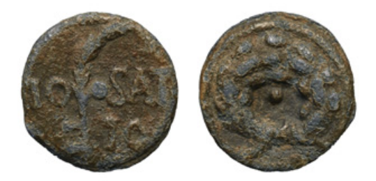
Figure 4.9 Pb token, 17 mm, 12 h, 4.32 g. Palm branch ending in a retrograde F, IO on left, SAT | IO on right / Wreath. TURS 507, Rostovtzeff and Prou, 1900: no. 103.

In a poem set during the Saturnalia, Martial describes the lavish nomis-mata , the coins or coin-like objects. <sup>68</sup> The same word is used by Martial to describe objects specifically exchanged for goods in the context of