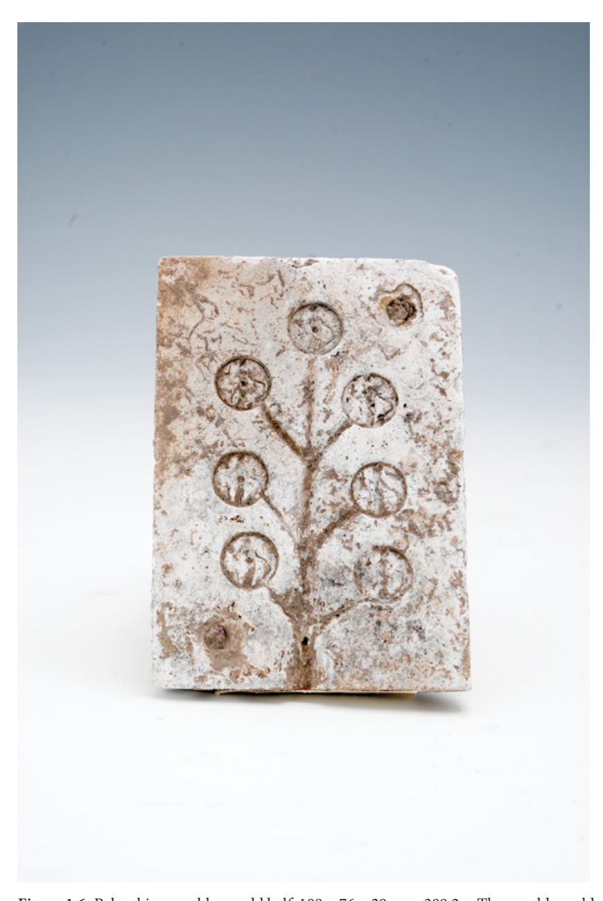
\label{eq:figure 1.6} \textbf{ Palombino marble mould half, } 108 \times 76 \times 29 \ \text{mm, } 389.2 \ \text{g. The mould would have cast seven circular tokens decorated with the image of Fortuna standing left.}