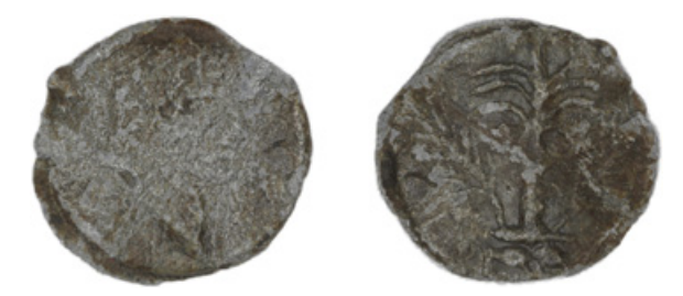
Figure 2.8 Pb token, 19 mm, 3.24 g, 12 h. Bare head of Vespasian right / Palm tree on a platform with two wheels; palm branch on left and on right. TURS 34.

Figure 2.7. The palm tree became symbolic of the capture of Judaea; it was shown on coinage, for example, alone or alongside Victory, piles of armour, triumphant members of the imperial family, Jewish captives, or the defeated personification of the region.<sup>59</sup> The palm tree had previously appeared with Victory on coinage of Vitellius in AD 69 (unsurprising given one of Victory's attributes was a palm branch), but under Vespasian it came to symbolise Judaea (and the associated Flavian victory in this region).<sup>60</sup> The representation of this mobile palm tree, however, is unique to tokens.