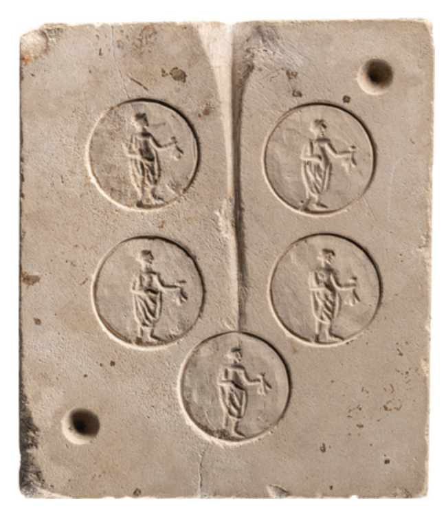
Figure 1.7 Palombino mould half, 93 \times 108 \times 28 mm, 561 g. The mould would have created 5 circular tokens of c. 25 mm in diameter. TURS 3578 (Pl. XII, 6).