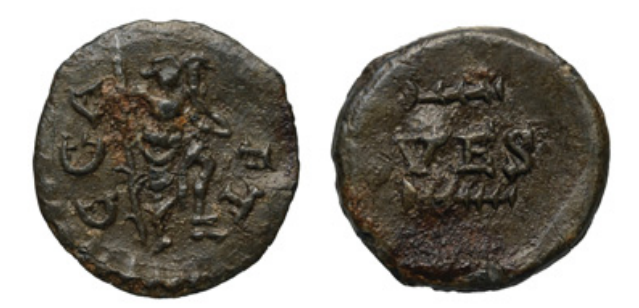
Figure 3.4 Pb token, 20 mm, 9 h, 3.9 g. River deity, draped from the waist down, standing right with left foot on rock holding a long reed in his right hand and cornucopia in left; CGA on left and FT on right / VES between two palms or branches. TURS 1682, Rostovtzeff and Prou, 1900: no. 420a.

Iconographic innovation can be found on another token type, which shows a male figure draped from the waist down, holding a cornucopia and reed, with his left foot on a rock (Figure 3.4). One imagines that this also is a representation of the Tiber or one of its outlets, but unusually the figure is shown standing rather than reclining. As noted above, Tiberinus might be portrayed with a variety of attributes, but these occurrences all show the deity reclining. The standing representation of the river might have referenced a now lost statue; the Nile is frequently portrayed standing on coins of Alexandria and one imagines this variation must have existed for the Tiber as well.<sup>47</sup> This particular image may have been more resonant than a reclining Tiberinus for the community using the tokens; it might have referenced a very particular statue and/or location within Rome as opposed to the Tiber more generally. Just as particular attributes served to make Graeco-Roman deities 'local' (e.g. the addition of the labrys to Athena on tokens at Oxyrhynchus in Egypt), so too might the alterations to the