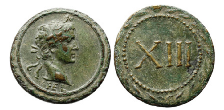
Figure 1.2 AE token, 22 mm, 4.52 g, 4 h, 27 BC–AD 57. Laureate head of Augustus right, FEL beneath, all within linear border and wreath / XIII within dotted border and wreath. Buttrey 1973, B5/XIII.