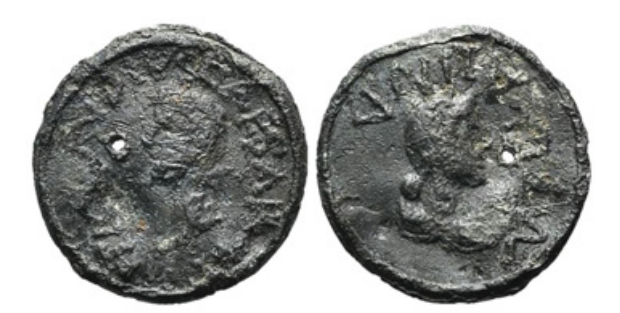
Figure 2.1 Pb token, 19 mm, 2.16 g. Bare head of Claudius left, TI CLAVDIVS CAESAR / Bust of Messalina right, MESSALINA.

Claudius' rule also saw the representation of numerous family members on tokens, with Messalina (Figure 2.1), Britannicus, Antonia the Younger and the future emperor Nero all making an appearance.<sup>14</sup> As Figure 2.1 illustrates, these tokens have obvious reference to the official coinage produced at the mint of Rome in terms of size, shape, the use of imperial portraiture and the placement of the legend. But tokens also carry otherwise unknown combinations of imagery, and designs not associated with the emperor on coinage. Messalina, for example, does not appear on the imperial coinage produced at the Roman mint.<sup>15</sup> A further example of this phenomenon is found in Figure 2.2. The token carries a portrait of Nero accompanied by a legend naming him;