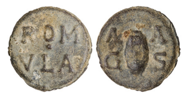
Figure 5.12 Pb token, 22 mm, 7.6 g, die axis not recorded. ROM|VLA / Shield (?) with A above G on left and A above S on right. TURS 1478.

Moving further west, a token mould half was uncovered during the excavations of the Insula delle Ierodule in Regio III during 2003–4. The mould half was made of lunense marble, and would have cast quadrangular tokens bearing an anthropomorphic figure holding a sceptre (?) with a container ( modius ?) between its legs. The mould was found in a corridor (Area 10) in a stratum of abandonment. Clay moulds and glass were also found, leading the excavators to wonder if there was not some type of artisanal workshop located within the building. Two coins were also found, both of the third century AD; the building itself was destroyed in the latter part of the third century.