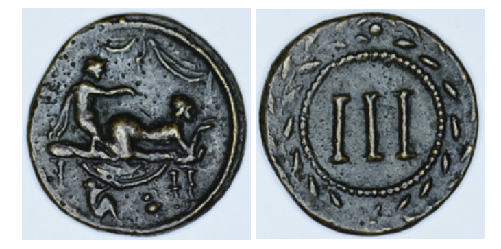
Figure 1.3 AE token ( spintria ), 22 mm, 4.92 g, 6 h, 27 BC–AD 57. Sexual scene. A man wearing a cape kneels on a kline and enters his partner from behind, who rests on her elbows. Drapery above, beneath the kline crouching figure on the left and jug on right / III within dotted border and wreath. Buttrey 1973, A9/III = Simonetta and Riva 1984 Scene 4.

Mutina dated to AD 22–57 provides a terminus ante quem for this series.<sup>23</sup> In a seminal work on these pieces in 1973, Buttrey suggested one possible use for these objects was as counters in gaming: this theory has since been developed by Campana.<sup>24</sup> In spite of the presence of numbers on these pieces and gaming counters, the current state of material evidence suggests that we should not interpret the so-called spintriae as gaming pieces. After all, these artefacts form a small subset of a broader collection of bronze, brass and lead monetiform pieces, of which only a few carry numbers. Moreover, objects