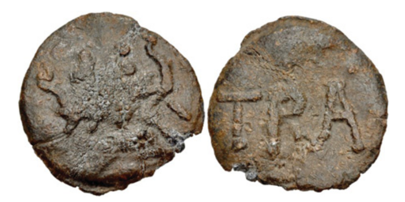
Figure 3.12 Pb token, 24 mm, 6.12 g. Two people in a boat (cymba), fish beneath/ TRA.

Tokens showing two or three people in a boat on one side and the legend TRA on the other are also known (Figure 3.12). The legend again might