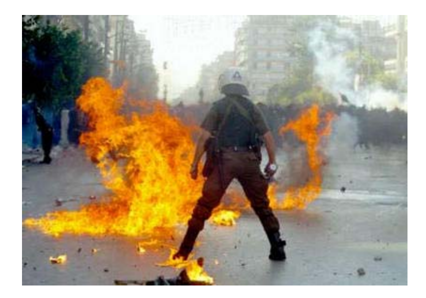
Plate 8. Policeman at the EU summit, Thessaloniki, June 2003.

restrained, unconcerned with the openness and softness of relationship, and built on the disciplined repression of physical needs and desires. This again is reiterated in the particular masculinities of a conventional, humourless and Leninist Left perspective that emphasises the violent necessity of proletarian revolution (e.g. Negri 1984: 73 in Callinicos 2001: 4).