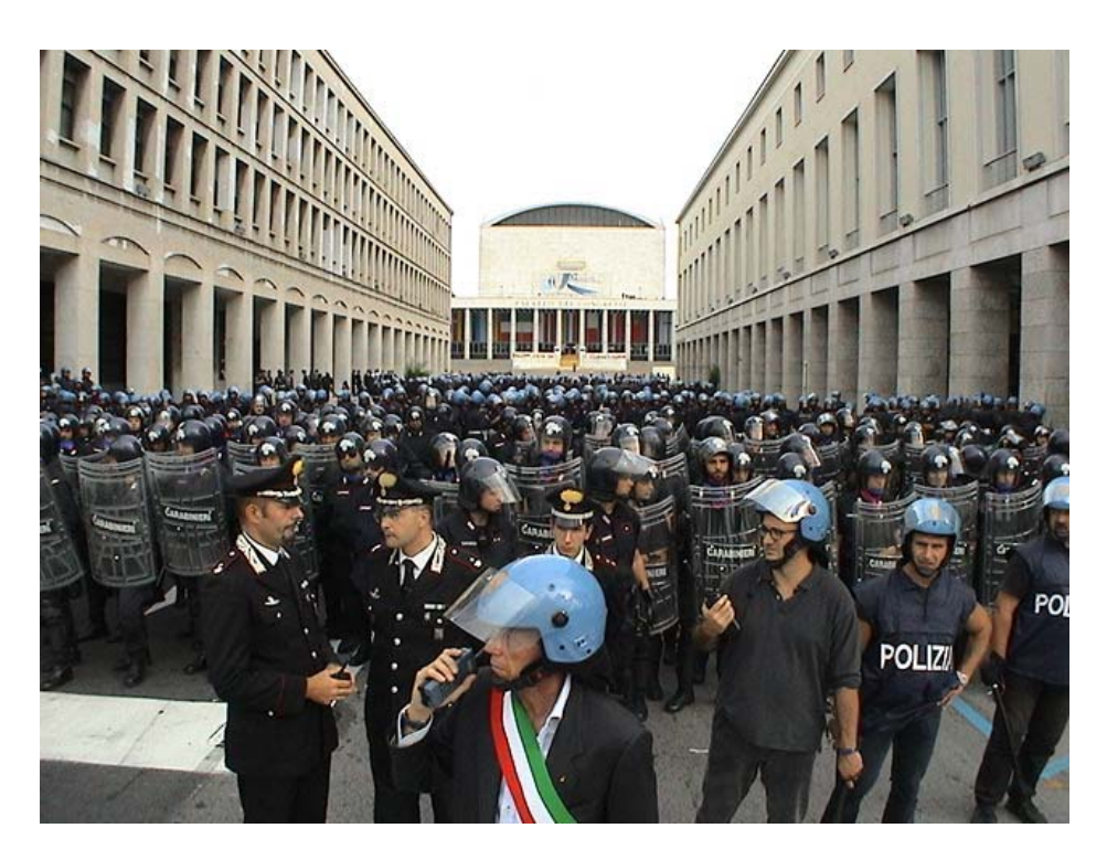
Plate 9. A small percentage of the visible police presence that marked constitutional discussions at the EU 'Intergovernmental Conference on the Future of the Union', Rome, 6 October 2003.