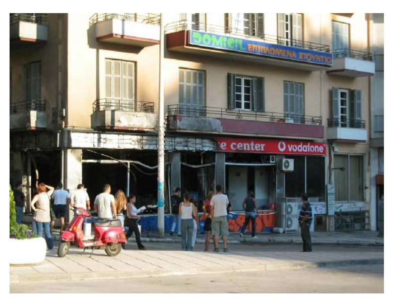
Plate 5. Petrol bombed Vodafone store on Ermou Street, Thessaloniki. Although a number of small, independent businesses were affected by the antiauthoritarian action in Thessaloniki on