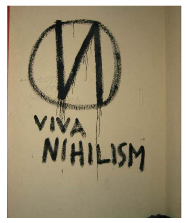
Plate 1. 'Viva nihilism!' – graffiti on the walls of the Philosophy Department at Thessaloniki's Aristotle University during the EU 'counter-summit', June 2003.

The vast majority of (anti-)globalisation actions and activists embody a nonviolent approach to protest and activism: either in the mass marches that form the visible edge of altermondialisation ; or in the disobediences and direct actions of the myriad microresistances enacted by groups and individuals protesting the character of contemporary globalisation processes. Nevertheless, the quoted words 'Viva Nihilism!' in the title of this chapter distil an ethos to protest by some activists and in some contexts. This quote comes from graffiti scrawled on the walls of Thessaloniki's Aristotle University, squatted by militant activists while protesting the EU summit which took place in Thessaloniki, Greece, in June 2003. As shown in Plate 1, the running black paint of the words and the symbolic encircled reverse 'N' capture a mood tangible amongst some militant activists: a mood fetishising the destruction of existing structures, emphasises the display of anger in protest, and manifesting as violence towards the physical symbols of capitalism and as a preparedness for violent confrontation with police.