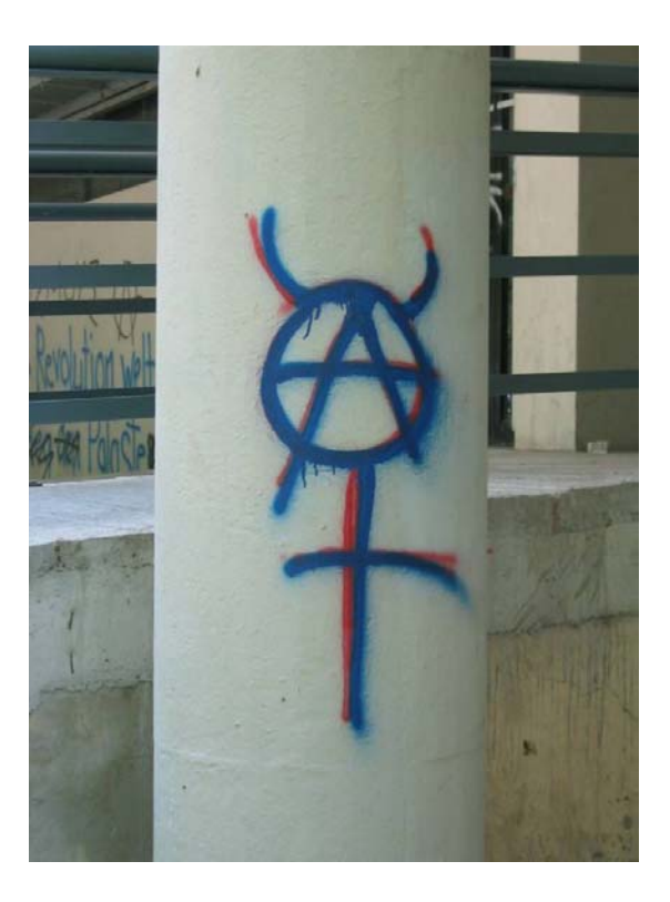
Plate 7. Female anarchist devil – graffiti-ed on the walls of Thessaloniki's Aristotle University squatted by activists during protests against the EU summit in June 2003.

Indeed a transgressing of the boundaries of 'polite bourgeois, feminine behaviour', for example, through participating in confrontational and possibly violent protest, arguably in itself might effect a liberating reconfiguration of the pacified female gender identity that is part and parcel of bourgeois patriarchal social organisation. The symbolic image from Thessaloniki in Plate 7 captures a sense of this going beyond of conventional bourgeois female identities amongst antiauthoritarian protestors.