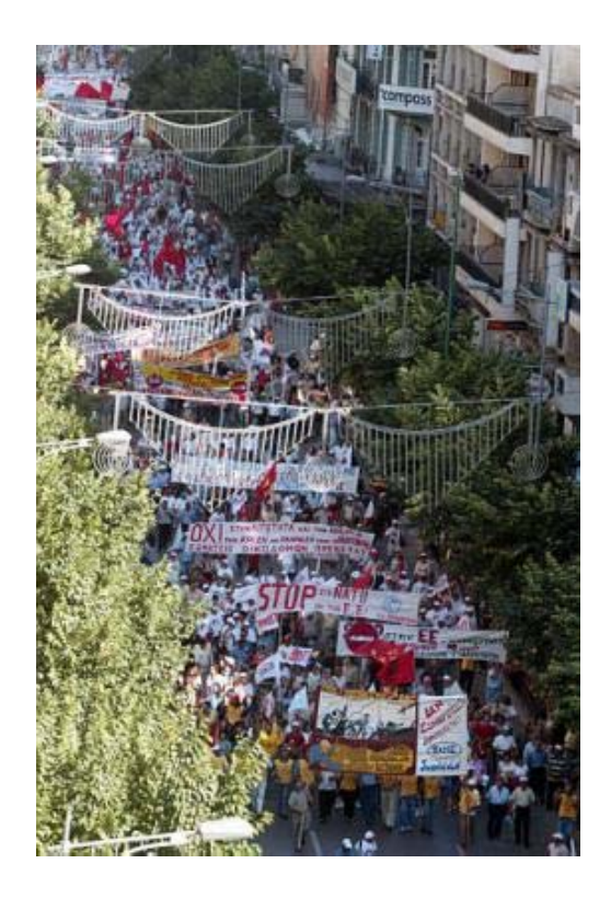
on the march was fewer than 100,000 but greater than 25,000, and that the numbers participating in the antiauthoritarian action were definitely upwards of a thousand (the Open Assembly of Anarchists and Anti-Authoritarians (2003) estimates numbers to have been around 4,000).