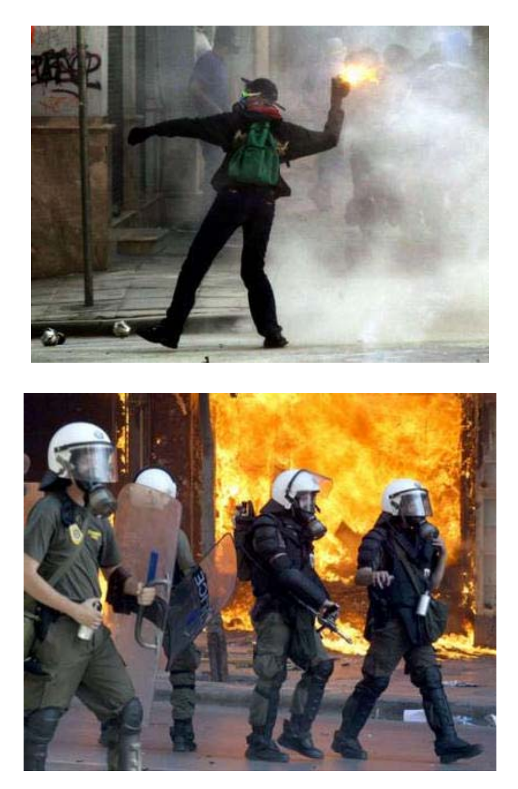
Plate 3. March on Tsimiski Street, Thessaloniki, organised by the Communist Party of Greece as part of the National Day of demonstrations on 21 June 2003 against the EU summit.