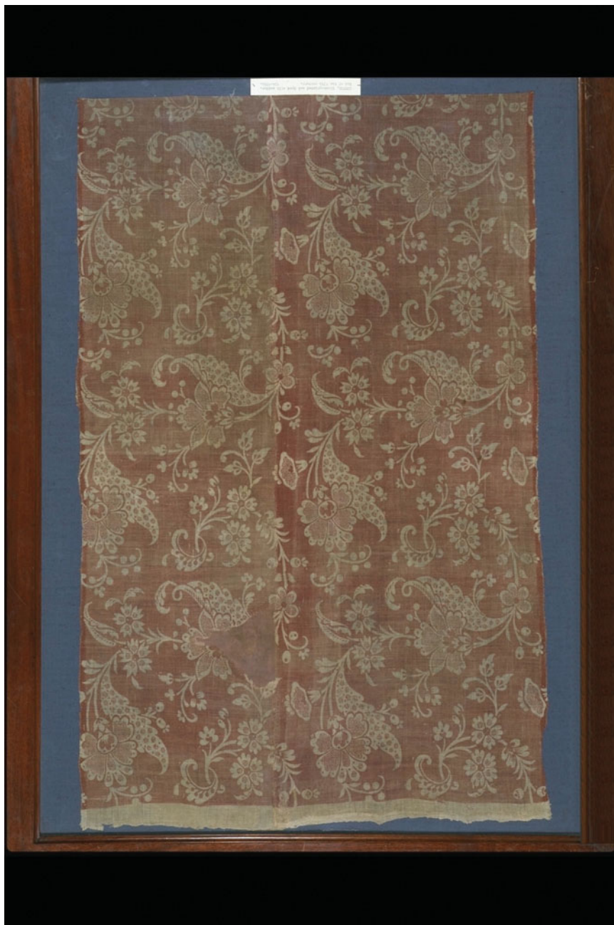
Figure 7. Block-printed cotton, possibly English or Dutch, c.1690–1700. At the end of the seventeenth century, Europeans could only produce dull-coloured and semi-fast printed textiles. Victoria and Albert Museum, 12A-1884.