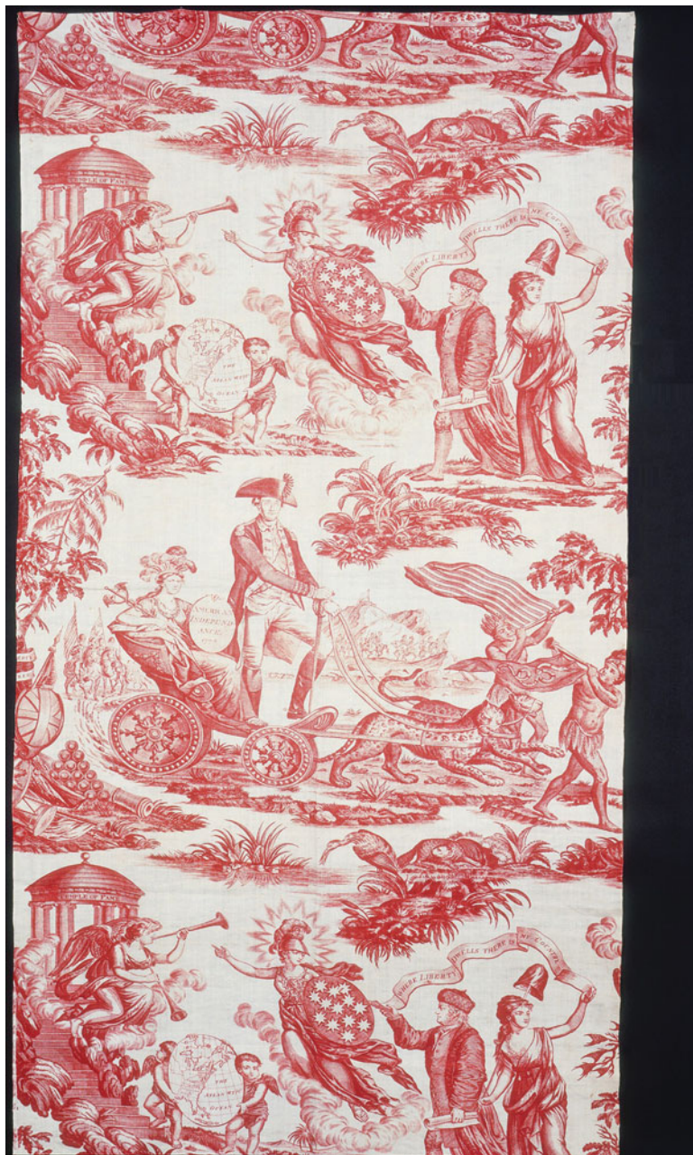
Figure 8. Plate-printed cotton and linen representing George Washington. England, c.1780–90. Victoria and Albert Museum, CIRC.93–1960.