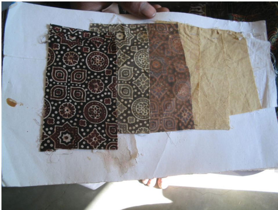
Figure 6. Cloth swatches of traditional cotton cloth produced with vegetable dyes by the Khatri brothers in Gujarat by using different mordant processes, 2005. Different colours and designs can be obtained by varying the use of dyes and mordants, but without changing the wooden block.

to cheaper varieties of coarse cloth produced for household consumption. 12 Southeast Asia combined two different traditions in textile finishing: ikat and batik. Ikat was based on the weaving of previously dyed yarn by knotting it, thus creating complex patterns through simple weaving, a technique already present in the eighth century. 13 Batik was based instead on the use of wax to prevent the dye from penetrating the cloth. This technique was widespread by the eleventh century, although it is not clear if it originated locally or came from other parts of Asia. 14 Printing was adopted in Japan only during the Edo period (1603–1868), but names such as bengara(-jima or -gôshi ) (striped or checked cloth from