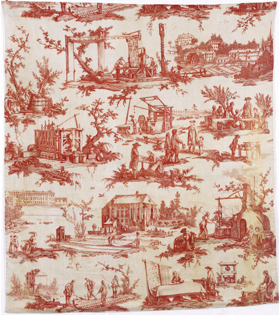
Figure 2. ‘Les travaux de la manufacture’, 1783. Vignettes represent the process of production of toiles by Oberkampff in his print works in Jouy-en-Josas. © Musée de l’Impression sur Étoffes, Mulhouse, n. 219.

The success of European cotton textile production was not just the result of major technological breakthroughs in spinning and weaving. By the late eighteenth century, Europeans were able to produce cotton textiles that could rival high-quality Indian goods. How this phenomenon came about is still a matter of debate. Under review are complex analyses of Europe’s technical knowledge, technological receptivity, and innovation, with particular attention paid to textile dyeing and printing, in which Europe had never excelled before the late seventeenth century. This article investigates the ways in which a branch of textile finishing emerged and developed in Europe between the second half of the seventeenth and the mid eighteenth century. Such an issue has been considered by a generation of historians,