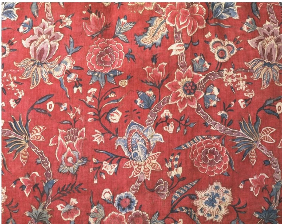
Figure 1. Painted cotton textiles used for a banyan garment (informal robe worn in Europe). Textile produced in the Coromandel Coast, India, c.1750. The brilliant colours and sophisticated design of Indian cotton textiles appealed to European consumers. Victoria and Albert Museum, T.215–1992.

that he ‘showed some in France to several dyers, who were filled with admiration at them, assuring me that the dyes of India are pure and quite simple, whereas those of Europe are inferior’ (Figure 1). 3