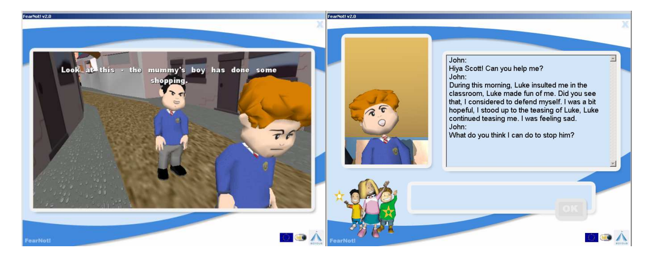
Figure 1. Screenshots of cartoon-like and interaction episodes within FearNot!.

the interaction situations and the characters' goals and mental states. These cartoon-like episodes are connected by interactive episodes where the user can 'talk to' the victim character via an instant messenger inspired interface i.e. by typing into a text box and reading the character's responses on screen. Here, the user can recommend coping strategies for the victim character to attempt in the following emergent episode.