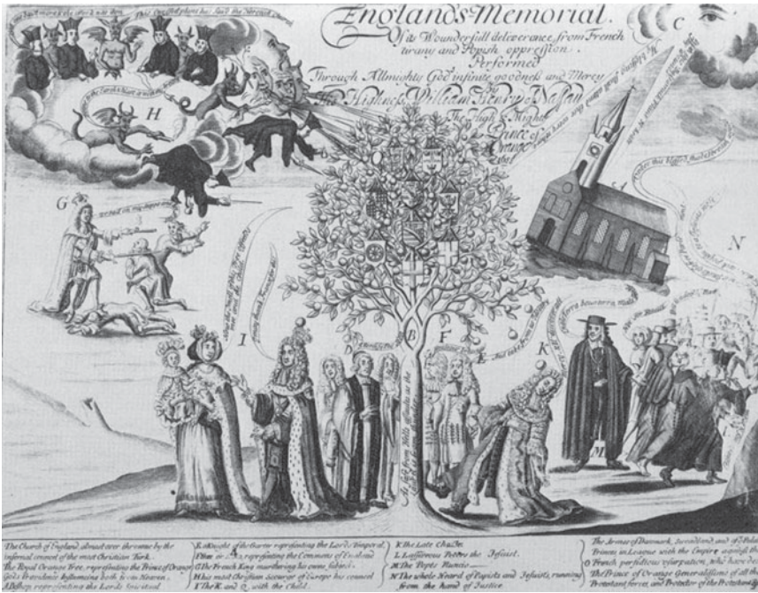
Fig. 2. England's memorial (1688) – an allegory of the Glorious Revolution. British Museum Satires 1186 © The Trustees of the British Museum.

lords, commons, and church cluster round and protect the tree of commonwealth. The tree, and hence the revolution, is nevertheless offensive to Queen Mary Beatrice who laments ‘How the smell of this orange offends me and the child’ (Prince James), while the Jesuits complain ‘How strong it smells of a free parliament.’ The image draws on a long history of anti-popery, celebrating deliverance from a threat both confessional and dynastic, to effect a counter-reformation in the commonwealth or church-state, but centres it round the similarly long-lasting metaphor of the tree. Indeed, the print may well be supplanting images of the Stuart oak (such as Figure 3 ) with a Williamite orange tree and hence intentionally breaking the association of the Stuarts with the welfare of the English commonwealth. 50 Following visual metaphors over time is one way in which the language of commonwealth can be charted.