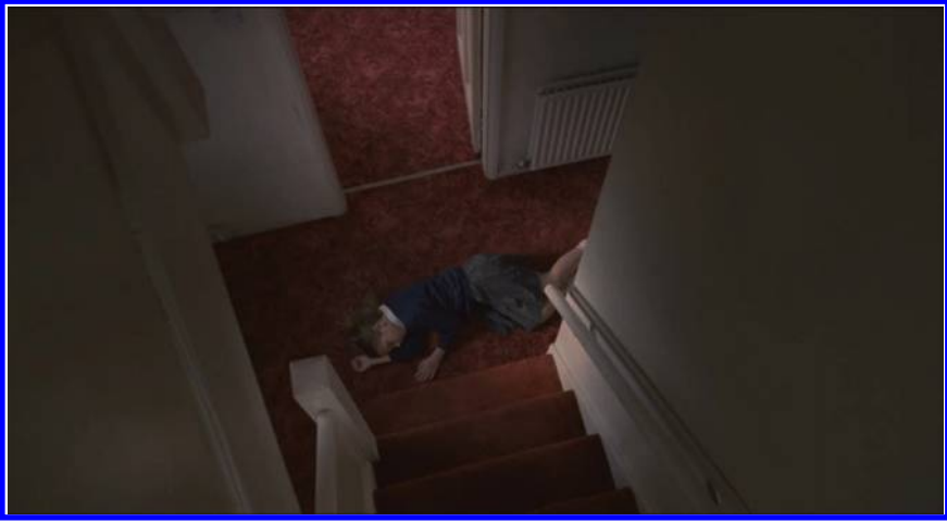
Fig. 1. Lucy in the first shot of The Unloved .

on Channel 4'. The film then immediately separates itself from this environment with a plain red title on black accompanied by birdsong. The film title fades to black and a child's voice intones: 'The Lord is my light and my salvation, whom shall I fear?', a prayer followed by the introduction of the ethereal, jangly music which will form Lucy's theme throughout the film and which continues over the first shot of the film, a high shot looking down on a young girl in school uniform (Lucy) lying at the foot of the staircase in a domestic hallway (Figure 1). This shot is held for fourteen seconds, and is followed by a closer, floor-level, eight-second shot of the back of the girl's head, cutting back to the first camera position which is then held for thirteen seconds while the passing of the day is signalled through changing light on the motionless figure.