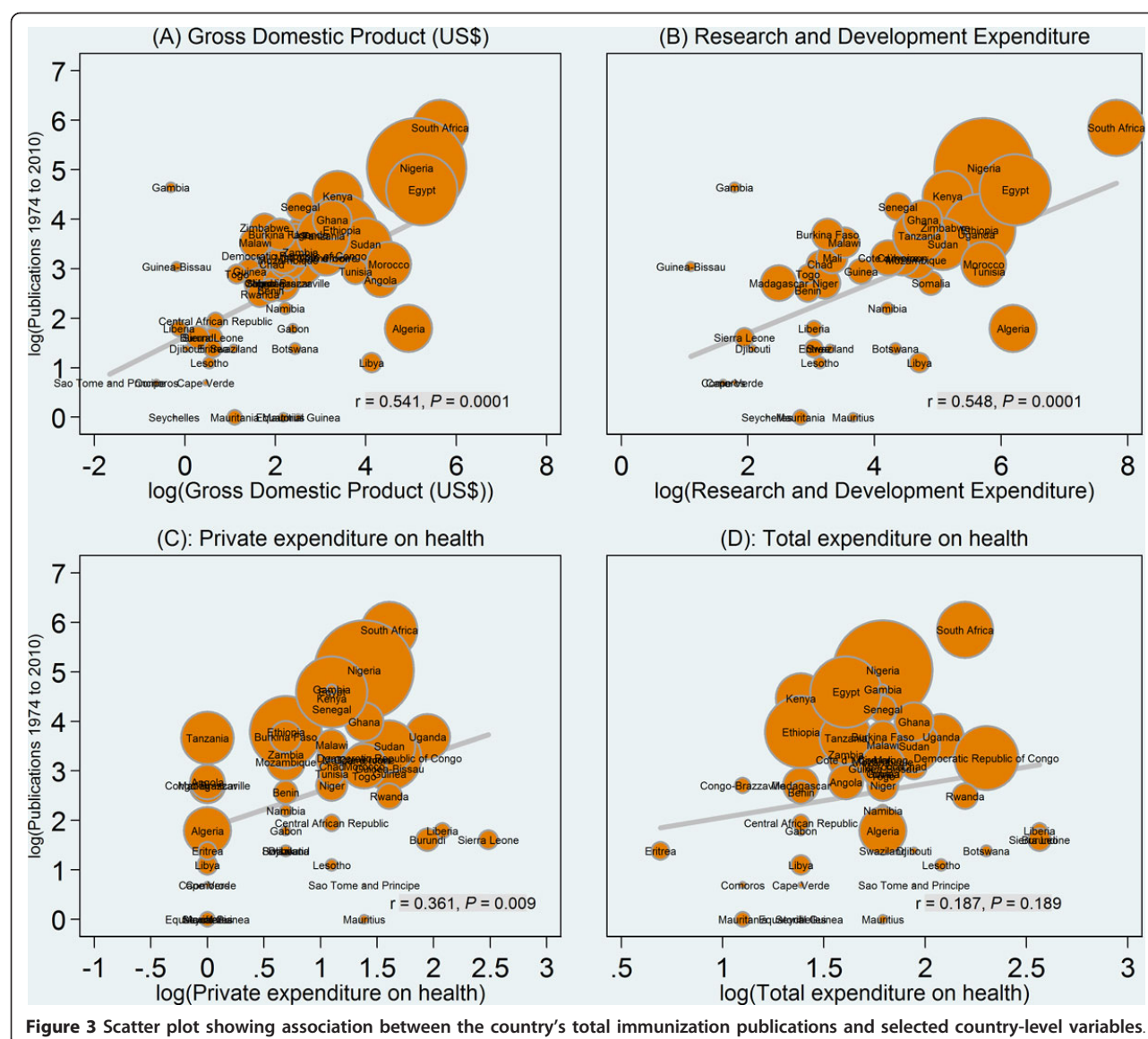
Table 4 Factors associated with childhood immunization research productivity identified by zero-truncated negative binomial regression models.