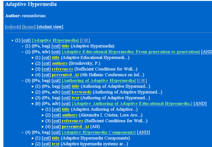
Fig. 4. Adding manual metadata in a MOT lesson

Figure 4 shows an extract of editing in the lesson environment (the import from Beagle++ generates extra information both for the domain map as well as for the lesson). The paper called ‘Adaptive Educational Hypermedia: From generation to generation’ and all its relevant metadata (title, authors, references, conference where presented) have been added automatically during extraction to the ‘Adaptive Hypermedia’ domain concept, at the highest level in the hierarchy. The paper ‘Adaptive Authoring of Adaptive Educational Hypermedia’ has been added to the domain concept ‘Authoring of Adaptive Hypermedia’, in a lower position in the hierarchy, as it is a more specific paper. The author can now manually add pedagogical labels to this new material, labeling the material ‘adv’ for advanced learners.