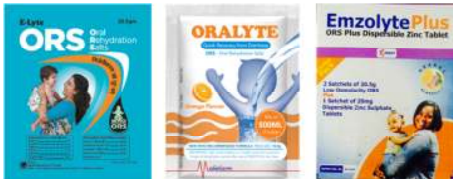
Figure 3: (a) New Indian ORS sachet, (b) New Ugandan ORS sachet, (c) New Nigerian co-pack

To date, results have been presented to local manufacturers and importers across the three focus countries. In Uttar Pradesh, India, the government is implementing pack design improvements for their ORS sachets at public health facilities (Figure 3(a)). Uganda currently has two local suppliers introducing the smaller sachet (Figure 3 (b)), two implementing pack design improvements and two suppliers launching a combined ORS/zinc pack. Nigeria now has five suppliers with co-packs on the market (Figure 3 (c)), two have implemented pack design improvements, and one will introduce smaller sachets in the longer term.