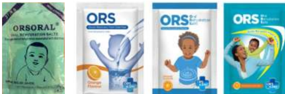
Figure 2: Examples of the three pack designs tested in the research, in design order, with an old pack from Nigeria for comparison on the left

The primary objective of this qualitative study was to explore optimal product presentations and product improvements for Oral Rehydration Salts (ORS), leading to higher caregiver adherence in India, Uganda and Nigeria. Desk research reviewed existing qualitative and quantitative studies on diarrhoea treatment behaviour, while interviews with key stakeholders including Non-Governmental Organisation (NGO) program leads, ORS manufacturers and regulatory organizations gave an overview of current products used to treat diarrhoea as well as perceived benefits and barriers to ORS usage. Following this review, concept development workshops generated ideas for product re-design and improvement. Fifty product designs were created. From these, three pack designs were chosen, plus seven new formulation concepts believed to represent best-fit options for addressing the five identified barriers: difficulty of preparation, difficulty of sourcing clean water, ensuring correct dosage, poor taste, and high product wastage. Figure 2 shows the three pack designs together with an ORS sachet currently on the market in Nigeria (pack designs were subtly altered for the three focus countries to align them with local ethnicities).