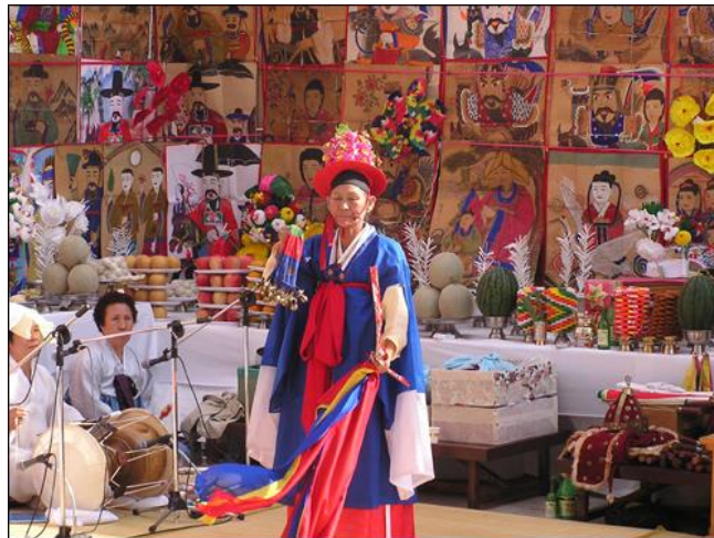
Figure 15. Kim Geum-hwa performs a gut . Kim is a Human Cultural Asset, widely known to the Korean public as 'national shaman'.

Shamanistic Hamlet productions could not easily be imagined outside of Korea. Given this, can it really be argued that Koreans have found hidden elements in Shakespeare,