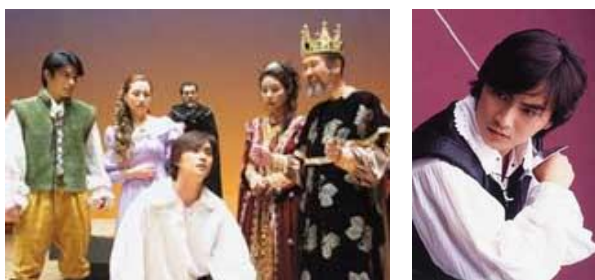
Figure 16. National Theatre Company of Korea's Hamlet (2001), directed by Jeong Jin-su. Hamlet was played by the famous celebrity TV actor Kim Seok-hun (Figure 17. right). So, there were a number of female audiences who came to see Kim. The female audiences greeted him with hearty cheers.