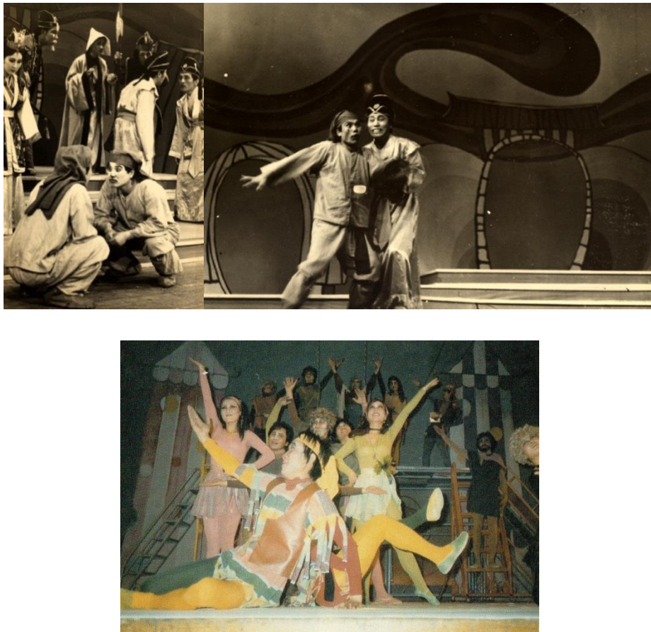
Figures 10 and 11. Gagyo's The Comedy of Errors (top 1971, bottom 1979)

class status. They were juxtaposed with the two servants who wore humble clothes with headscarves. The faces of the servants were painted white and given an exaggerated comic look, while their masters' features appeared more natural. The makeup style of the servants was borrowed from traditional Korean mask-dance dramas. The servant's name, 'Maltooki', is the name of a humble stock-character in traditional mask-dances. The stage design was not documented, but it would have been very simple and rough (as can be seen in the figure below).