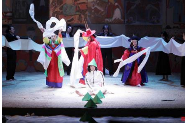
Figure 14. Yohangza's Hamlet (2009) (top), Hamlet in training clothes sits upstage while the shamans perform their gut .

of the audience (those who directly suffered from hardship), it is not able to account for the popularity of the tragedy among the younger generation who did not experience the historical turmoil that existed prior to the 1990s.