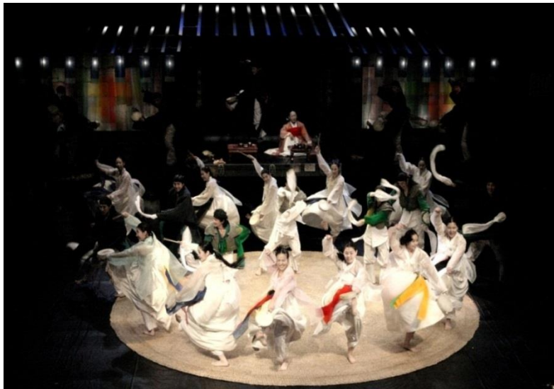
Figure 23. Party at the Capulet house

The performance began with a sword dance featuring actors in green (Montague) and brown (Capulet) dresses. The sword dance had in fact been a form of entertainment at the Korean royal court in the past. Here the sword dance was originally just a part of Mokwha's rehearsal process, but it was soon included in the performance itself. The background music to the dance was melancholy, which does not fit the dance's gestures very well. It predicted