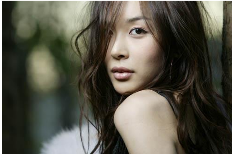
Figure 30. Harisu in a cosmetic advertisement in 2001. Harisu was even promoted as ‘Kylie Minogue of the East’ by her Taiwanese record label.

However, apart from gender issues, the Harisu phenomenon has contributed to the spreading of the new male figure, soft and pretty man, also known as kkonminam (flower boy), in the 21 st century. It appears that the director, Park Jae-wan, adopted the word ‘trans’ to reflect the Harisu phenomenon in order to increase his production’s marketability. The English word ‘trans’ was at the time a colloquialism among Koreans as a means of referring to transgender people. Park certainly intended to have Vike (Viola in Twelfth Night ) look like a pretty male-to-female transgender person. In this way, the other main male character, Olly, (Olivia in Twelfth Night ) in Trans Sibiya was also an easy-going and tender man. Likewise, while the actors were portrayed woman-like, then the actresses should be deprived of feminine beauty and play the comic male characters in Shakespeare’s comedy. Therefore, it can be claimed that Trans Sibiya was a feminized version of the Shakespearean comedy. The actresses outnumbered the actors, which was a rare case for renditions of Shakespeare’s plays, as the works list more male characters than female counterparts. Even for the audiences, it would have been thought that Shakespeare’s plays present heroic and strong male characters who always lead with passive and vulnerable heroine, given that the popularity of the tragedies. Therefore, Trans Sibiya could challenge such an idea.