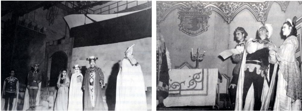
Figure 5. Macbeth (left) and Figure 6. Othello (right) by Sinhyeop in 1951

(the venue and the location unspecified)