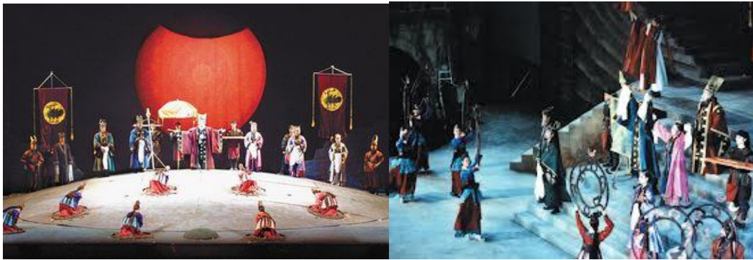
Figure 19 (left). King Uru at the National Theatre of Korea (left, 2000)

instruments were kayageum (a 12-string Korean instrument), daegeum (a Korean woodwind instrument), as well as 'cellos. The set design by Park Dong-woo was simple; there was a long and wide platform over the centre stage. This design might have been planned to give a surreal atmosphere, which corresponded to the unrealistic setting of the production. The costumes looked historical, yet did not define any specific period. The clowns were given the usual traditional Korean dress for humble singers in traditional theatre, and other characters wore fanciful costumes that offered a fantasy of the past. The clowns also wore the masks of genuine talchum . The acting of the production was eclectic; the NTCOK actors' realism-based acting juxtaposed with the NCCOK's traditional Korean acting style which based on pansori .