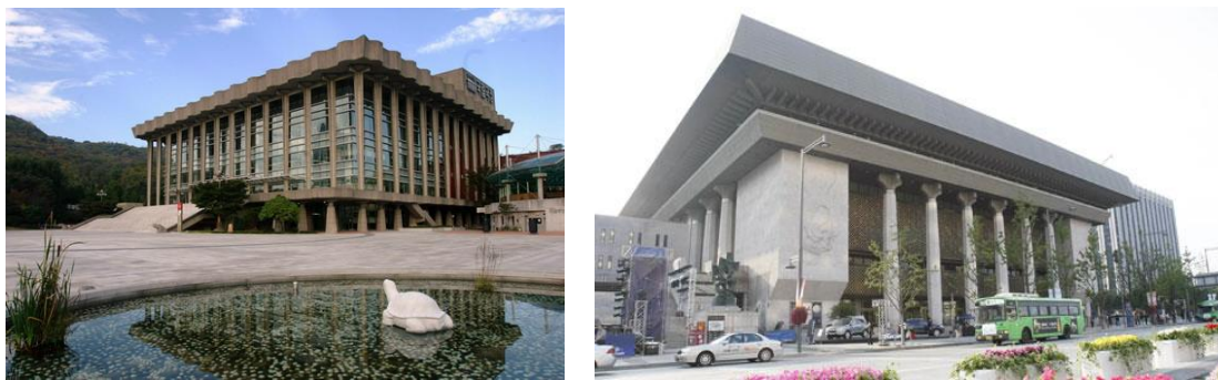
Figure 12. The façade of the National Theatre of Korea (left, founded in 1950 moved to the present location in 1973) and Figure 13. Sejong Centre (right, founded in 1978). The National Theatre is located on the slope of Namsan mountain, at the centre of Seoul. Sejong Centre is founded on Sejongro road which embraces many important buildings such as The First Integrated Government Building (to the right of the Sejong Centre in the photo), the Ministry of Culture and Namdaemun gate. The street is the most important street in Seoul, in terms of politics, history and economics.

fifteen metres in width. They are usually located in a rented space, usually occupying one level of a building. 63 Most of them are located in the basements of buildings and are therefore charged smaller rent. The public-funded venues charge much less rent and have larger stage and better equipment (lighting, backstage, dressing room). It is very competitive to put on a production in the public theatres, as there are numerous applications for limited opportunities. A rental period for public theatres is normally short, at most a fortnight.