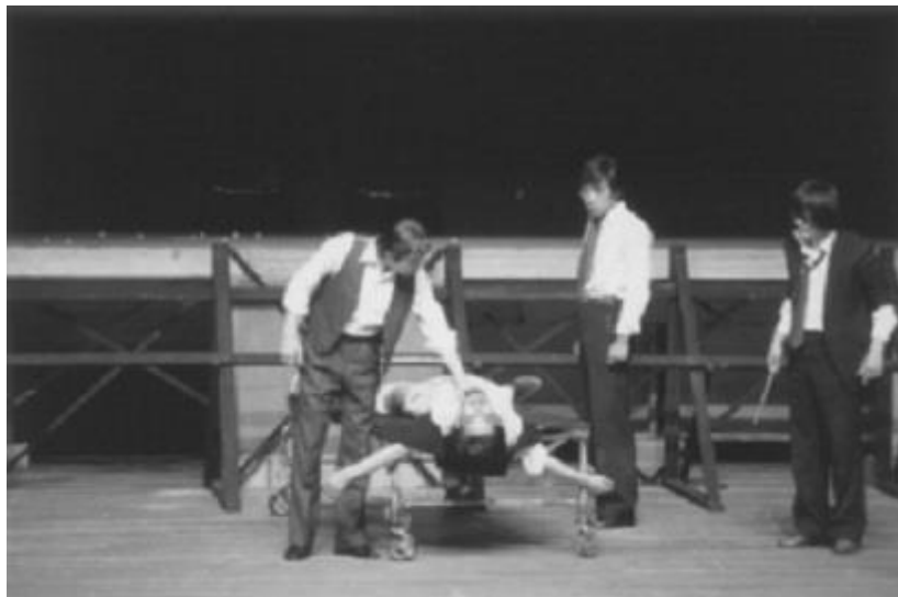
Figure 27. Hamlet being tortured by Rosencrantz and Guildenstern in Hamlet and Orestes