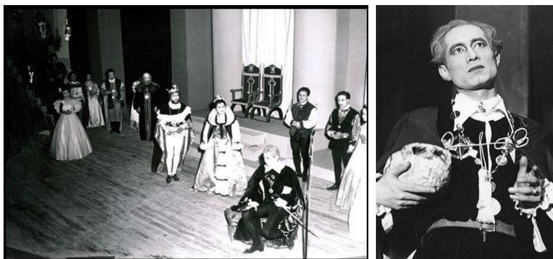
Figure 7. Hamlet (left) at the Drama Centre, Seoul, 1962 (dir. Yu Chi-jin).

When the Lee dictatorship was overthrown by the April Citizen Revolution in 1960, Koreans briefly experienced a period of democracy until the 5.16 military coup d'état led by General Park Jung-hee in 1961. When Korea was politically stabilised after Park's ascendance, there emerged new theatre companies such as Silheom and Gwangjang, most of their members were from elite universities in Seoul. They studied either at theatre departments or learned their theatrical crafts at students' companies. The new companies adopted a wide range of Western theatrical styles, from realism to expressionism, and staged contemporary European and American plays as well as Shakespearean works. The audiences for these theatre companies were mostly comprised of university students and academics. The status of theatre as an art-form for the intelligentsia, who would have internalized Sinhyeop's idea of 'pure theatre', evolved at this time and persisted until the 1990s.