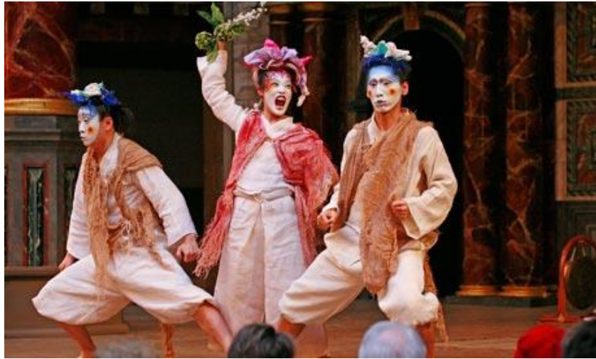
Figure 26. Dot (Oberon) and two Duduri (Puck)

performance on 1 May. The weather was quite pleasant. It was not very cold and there was no rain that evening. This was in fact ideal weather for the performance at this open-air theatre.