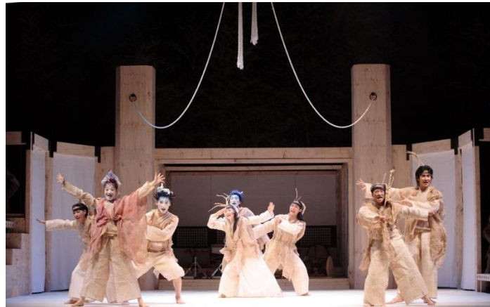
Figure 25. The stage of A Midsummer Night's Dream at Myeongdong Arts Centre, Seoul, August 2011.

Despite this arrangement of the characters according to a Korean theme, other elements of the production did not remain distinctively Korean. The music was mixed with Korean folk songs being sung by actors, and included both traditional instruments and modern electronic background music. The costumes divided into those of the lovers, which seemed to be from no particular time or place, and the clothing of Ajumi and the dokkebi which was reminiscent of typical peasant garb from the Joseon period of Korean history. The white make-up for the dokkebi seems to have been an influence taken from Kabuki. Such