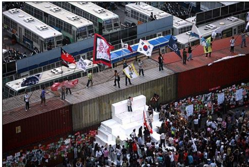
Figure 29. Protesters on the shipping containers in front of the Sejong Centre in 2008. Police buses beyond the containers.