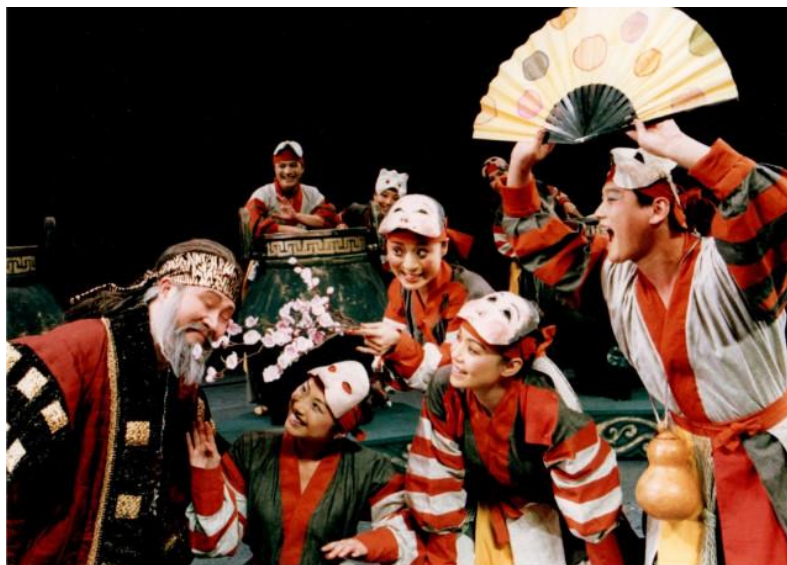
Figure 21. Mad Uru and the Clowns

fatale or man-eater in the Korean context. When Uru was found by the blind Gohul, Uru was playing a childish game, killing a fox, with the clowns. It seems much resentment was felt, but Uru was not as sad or miserable. Uru even looked to be a merry old country man emancipated from the burdens of ruling the secular world. Consequently, his death might have evoked pity in the audience, yet, must have failed to create the solemn atmosphere, which can be felt in King Lear . Such a characterisation of Uru was buoyed with Clowns, who contributed to create laughter with their comic gestures and speech and were the main singers of the production, along with Bari. Clowns were intermediaries between the stage and the audience. They played the characters of Clowns who amused Uru, yet they also gave predictable or comic comments in their song at the beginning or the ending of each scene. When they sang the songs, they were not only being the characters, but also being the pundits of what was happening on the stage. Such roles for the Clowns derived from characters of talchum , in which the characters constantly talk to the audience about situations in the play.