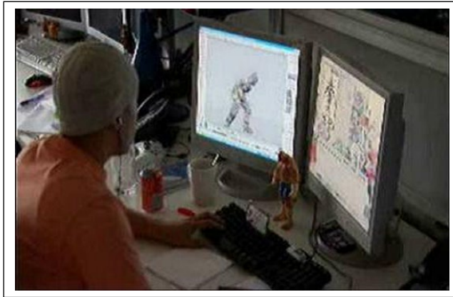
Figure 1. A rigger at work.

During the fieldwork, we observed how components of the design documents participated in the interactions between the developer teams. For example, when assets were passed between teams, the game, art and technology design documents would be used to check whether both sides of the handover were satisfied with the exchange. Members of the design team involved in the conceptualization of the game would check with the concept and 2D artists that the 2D static drawings corresponded to what was specified in the GDD. This artwork would then be passed on to the ‘riggers’, who converted these drawings into 3D and developed ‘meshes’ that made possible the digital manipulation necessary to animate them.