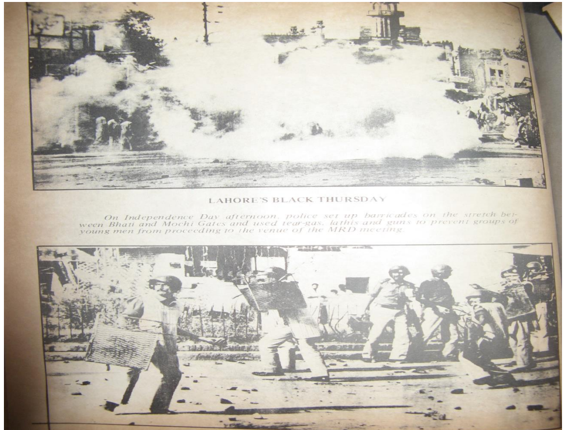
Figure 7 Provincial Government's violent response to the MRD's peaceful protest on 14 August 1986 in Lahore.

action to stop its workers from engaging themselves with the government's supporters who were tearing down their posters. 1160 They were unable however to stop the violence that then exploded throughout the city.