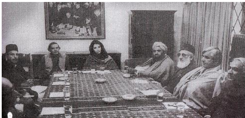
Figure 4 BB chairing the MRD in process meeting in 1980.

from both parties, 525 they finally agreed on one broad agenda 'Pakistan and martial law cannot exist.' 526 Finally on 6 February 1981, three major demands were put before the regime under the umbrella of the Movement for the Restoration of Democracy, which will be discussed in the next chapter.