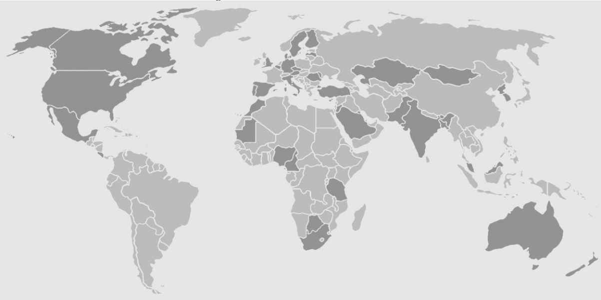
Figure 3: Worldwide Locations of Authors

questionnaire was not used to carry out a true quantitative analysis, but was seen as a democratic means of conveying common views and achieving ‘crowd-voting’ (Howe, 2008). The results of this questionnaire are reported throughout the following section. Regarding demographic details, 20% of the authors are aged 30–39, 35% 40–49, 35% 50–59 and 10% 60 and above. The average amount of work experience in E&T is around 20 years. Figure 3 shows the locations of the authors, shaded in a darker colour.