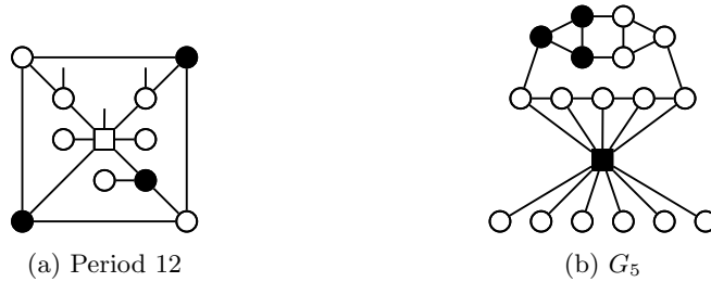
Figure 3: Graphs with more general rules at v_1

Finally we give an example of a triangle-free graph on which period 12 is attained, together with a general construction to show that any period is possible without the restriction that v_1 is not in a triangle. In each case a more complicated rule is required at v_1 . In Figure 3a, v_1 takes state +1 at time t+1 if and only if |N_1 \cap U_t| \in \{0, 2, 3, 4\} , and every other vertex follows the majority rule.