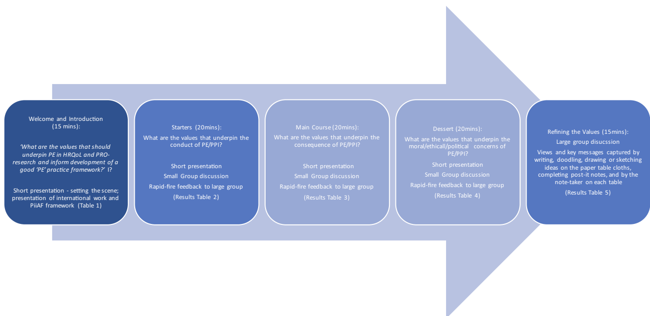
Fig. 1 Key Steps in Patient Engagement Café—Establishing the values associated with PE in HRQoL research

To set the scene, an overview of international work undertaken by a range of groups exploring ‘values’ associated with good PE was presented, for example, the