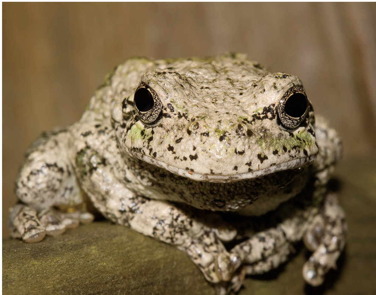
Tree Frog ( Hyla versicolor )