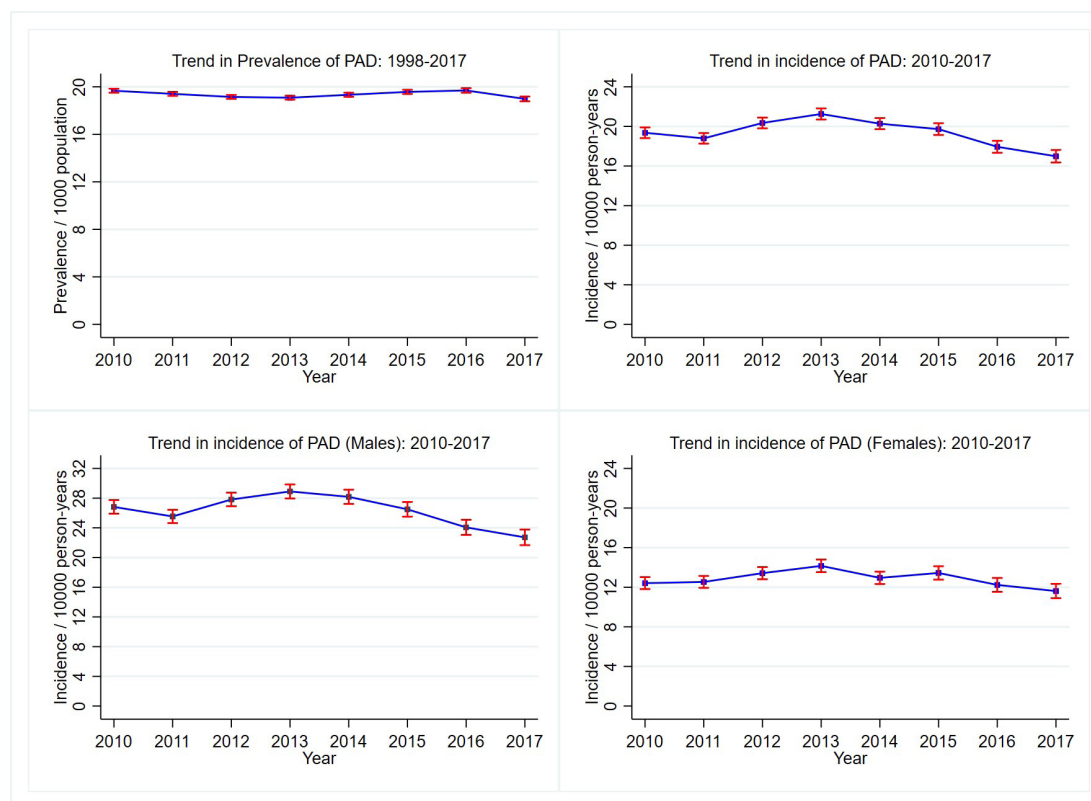
Figure 1 The changing prevalence and incidence of pad among UK adults aged 40 years and over, 2010–2017: sequential cross-sectional studies were performed on 1 January each calendar year from 2010 to 2017 to calculate the annual prevalence of PAD. Prevalence has remained relatively steady, whereas incidence has dropped. This appears to be accounted for by a drop in incidence in men over the study period, compared with women in which annual incidence has remained stable. PAD, peripheral arterial disease.

showing fewer women at risk of cardiovascular events are prescribed these medications, especially statins. 9 At the same time studies have confirmed that statins are equally as effective at reducing all-cause mortality in women and men.