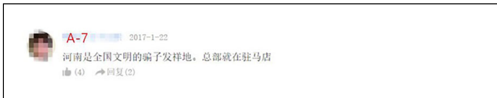
Figure 1. Tencent user A-7's comment. Translations: Tencent user A-7: Henan is the home of fraudsters, which is well-known 2 across the country. The headquarter [of these fraudsters] is in Zhumadian [Henan].

analysis. All user comments beneath the 10 news reports were retrieved from the commentary sections of Tencent and NetEase, resulting in a total of 7792 comments collected.