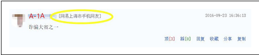
Figure 2. NetEase user A-1A's comment. Translations: NetEase user A-1A (location: Shanghai City): [Henan is] one of the provinces, which is well-known for fraud.