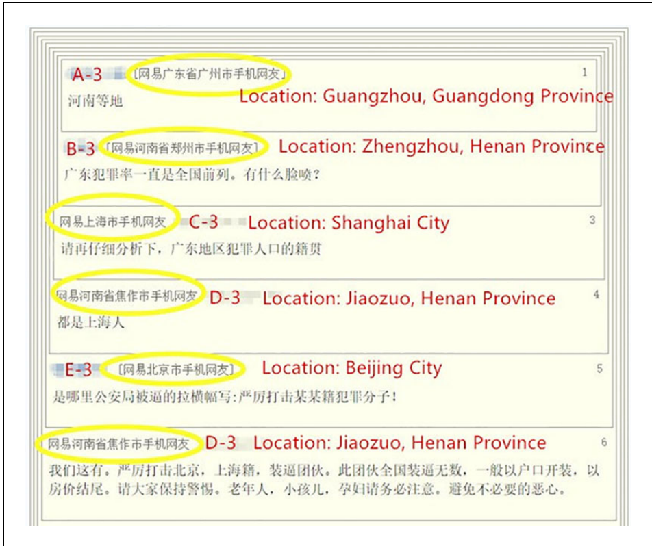
Figure 6. Amplified arguments between NetEase users. Translations: NetEase user A-3 (location: Guangzhou City, Guangdong Province): [This news story is about] places such as Henan. NetEase user B-3 (location: Zhengzhou City, Henan Province): Guangdong Province has the highest crime rate in the country. What on earth are you in the position to judge [Henan people]? NetEase user C-3 (location: Shanghai City): Please analyse this in detail – where are these criminals in Guangdong originally from? NetEase user D-3 (location: Jiaozuo City, Henan Province): [They] are all from Shanghai. NetEase user E-3 (location: Beijing City): In what province the local police have to produce pull-up banners, saying: fight a decisive battle with criminals from that place! NetEase user D-3 (location: Jiaozuo City, Henan Province): We have it here. Fight a decisive battle with posers from Beijing and Shanghai. These posers cannot help showing off all the time. Their performance starts with talking about their hukou and ends with discussing the price of their house. Everyone, please be alarmed. The elderly, children, and pregnant women must pay particular attention [to this alarm] and avoid being disgusted.

As the above analysis revealed, the IP-address function automatically locates NetEase users’ geographical position by recognizing the IP addresses of the devices on which they access the Internet. NetEase users’ current location is revealed as soon as they generate a comment. This IP-address function merely displays the place where a NetEase user’s body is temporarily situated. Yet, the connotation of this locative information, as a symbolic sign, is shaped within Chinese society, where people’s regional identity has been economically and sociopolitically constructed to be prominent. Displayed as the most notable digital sign of a user’s presence in the commentary section, the attentive affectivity of the locative information is activated. This affectivity encourages Internet users to recognize each other through their geographic location displayed on their digital