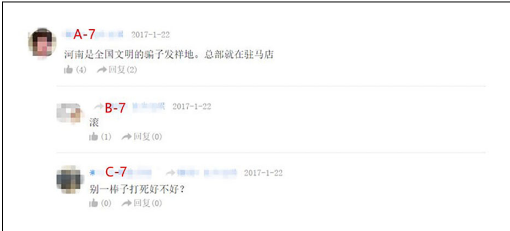
Figure 5. Arguments between Tencent users involving unbiased comments. Translations: Tencent user A-7: Henan is the home of fraudsters, which is well-known across the country. The headquarter [of these fraudsters] is in Zhumadian [Henan]. Tencent user B-7: Get lost! Tencent user C-7: Do not judge the whole population because of some of them, okay?

Ironically, this call was exploited by user D-3, who appeared to be from Henan and claimed that it is Shanghai gangs, who are roaming the country and committing crimes everywhere.