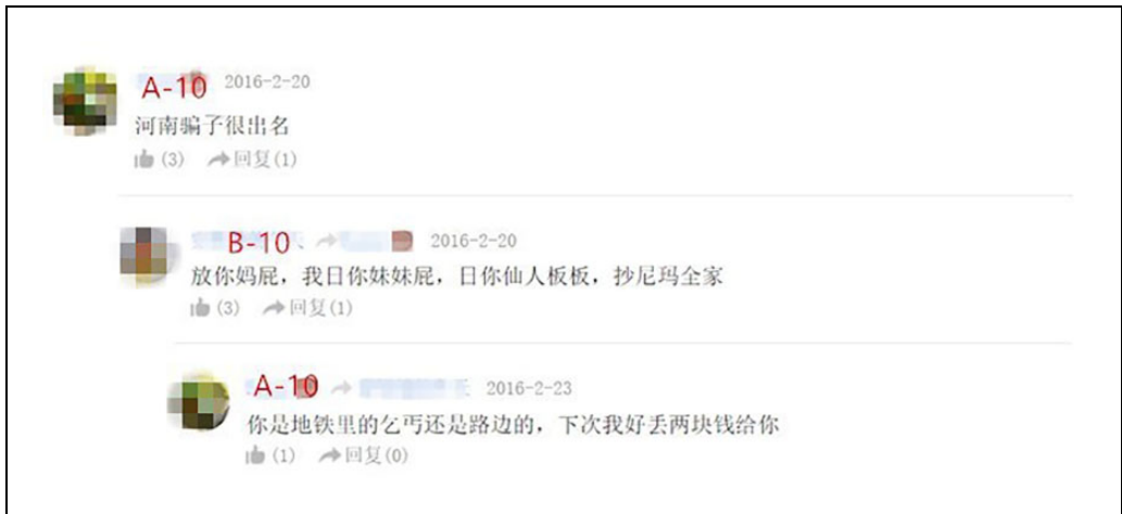
Figure 4. Arguments between Tencent users. Translations: Tencent user A-10: Henan fraudsters are so well-known. Tencent user B-10: F***ing bullshit! I f*** your sister's a**, f*** your ancestors, and f*** your whole family. Tencent user A-10: Are you a beggar on the metro or in the street? I would give you two quid next time.