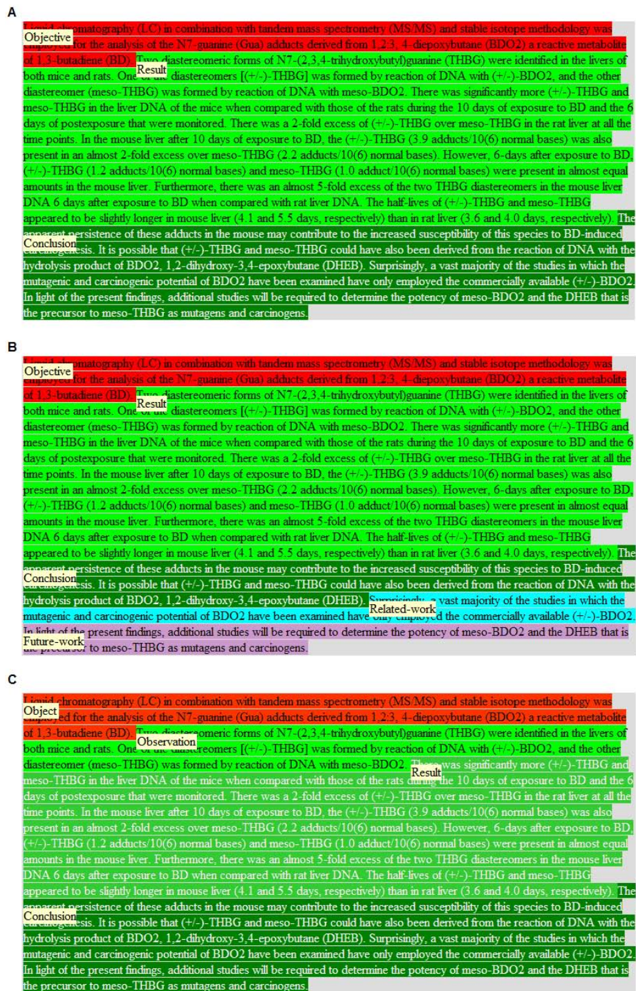
Figure 1 An example of an abstract annotated manually according to S1 (A), S2 (B) and S3 (C).