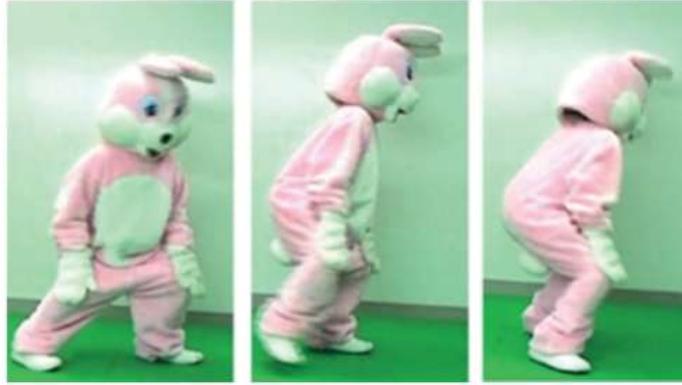
Figure 2. An example of manner of walking, used by Imai et al. [63], which sound symbolically matches the novel word, 'nosunosu'. In a pretest, Japanese- and English-speaking adults judged the novel word 'nosunosu' to sound symbolically match this heavy and slow manner of walking. (Online version in colour.)